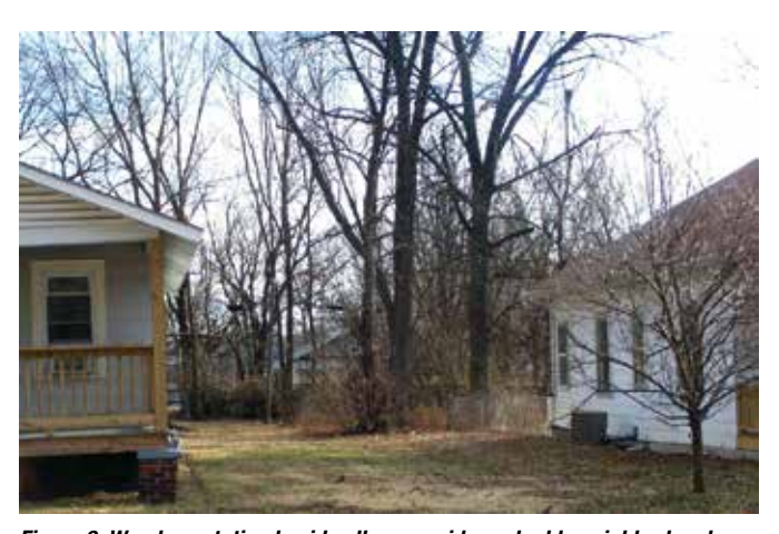
Figure 9. Wood vegetation beside alleys provides valuable neighborhood habitat.

To gather information, participants also walked and drove through their neighborhoods, identified and photographed various features and places of importance, and recorded their observations and the reasons for designating or identifying a certain habitat type or special feature. Figures