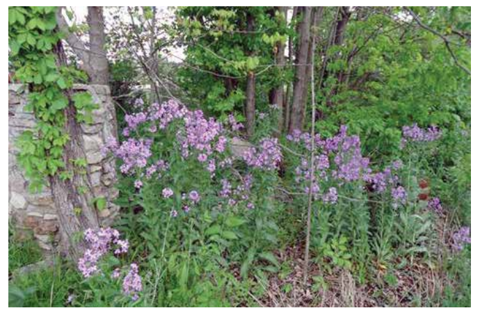
Figure 7. Screening cover along a neighborhood road provides valuable wildlife habitat.