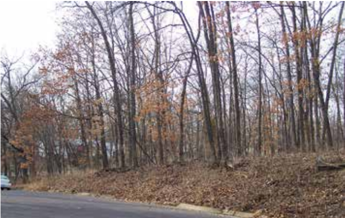
Figure 2. Parks and open areas are often the only links people living in urban environments have to nature.

spaces — can provide important vegetation and plant communities that are beneficial for a variety of species (Figure 1). Open areas, parks and forested habitats within urban environments may provide the only links many people have to nature and thus are important assets to the quality of life in the community (Figure 2).