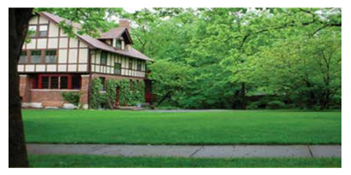
Figure 11. Landscape features around neighborhood homes provide valuable habitat areas for a variety of wildlife.