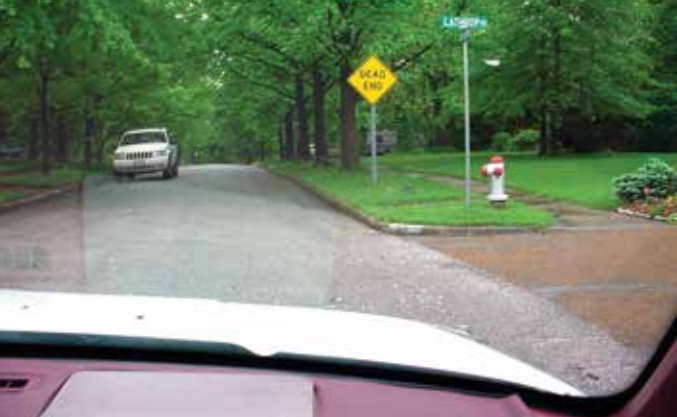
Figure 4. Walk and drive through the neighborhood to identify and assess land cover types, habitat conditions and unique natural features.