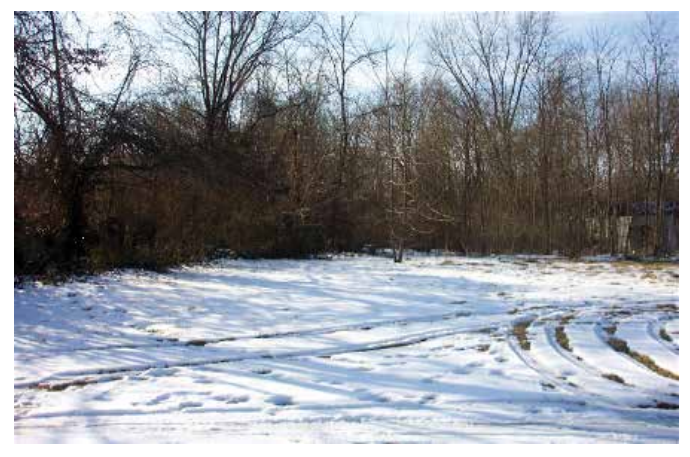
Figure 8. Vacant lots provide valuable habitat areas.

identify important habitat and natural resource features. The participants used aerial photos to identify valued places within their neighborhoods.