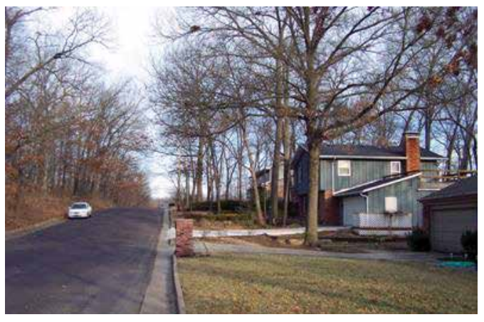
Figure 10. Mature trees and small woodlots were identified as valuable habitats in several neighborhoods.