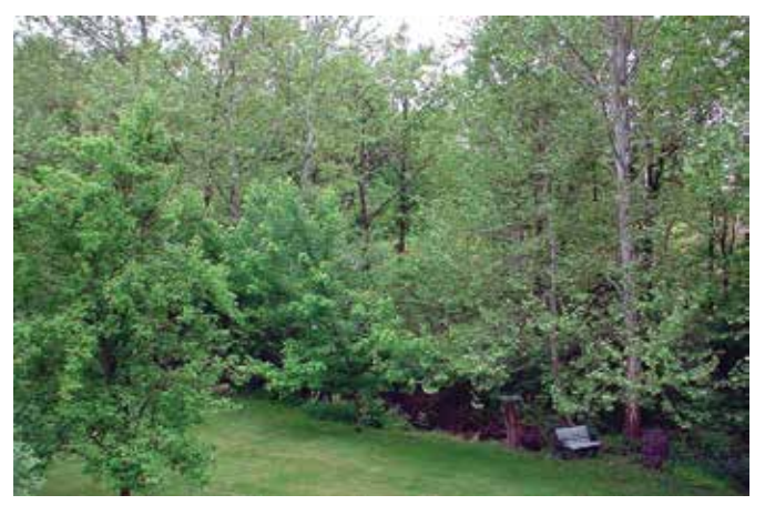
Figure 3. With proper planning, native vegetation, trees and shrubs can be maintained to provide many benefits for wildlife and areas for relaxation.

The following natural resources assessment tool provides a means to help identify priorities and issues that need to be addressed to enhance an area's wildlife habitat and natural resources. The tool was designed by Frey (1999) to be used by individuals or groups interested in enhancing