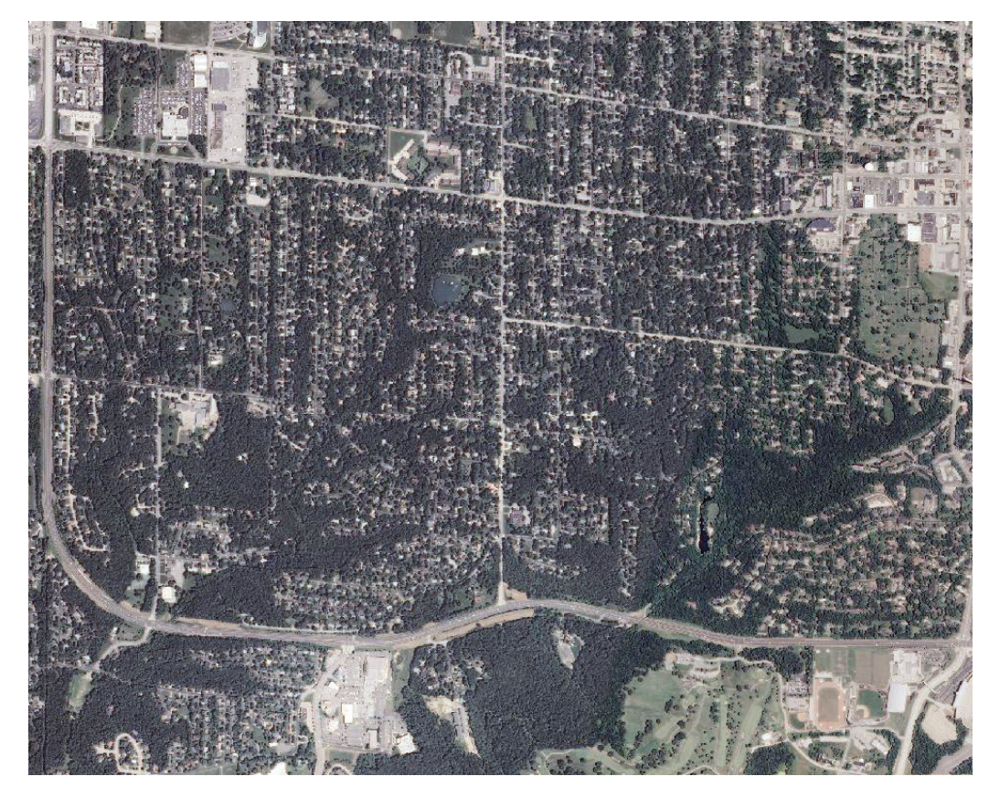
Figure 12. Aerial photo depicting habitat and land cover types used to develop a biotope map of west-central Columbia, Mo., neighborhoods.

This process was also used to develop a biotope, or land cover, map for the City of Columbia, Mo. (Figures 12 and 13, Table 3). The biotope map depicts land use, habitat types and land cover types within the city, and can be used as a planning tool with neighborhood residents and city planners as a means to ensure that important habitat features and special features that provide benefits are maintained within the community.