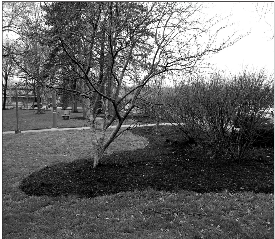
Figure 2. Idea for landscape plantings. Consider planting groups of trees and shrubs in large, mulched planting beds. Such groupings can be attractive and simulate natural conditions.

Many large-balled and burlapped trees are sold with wire baskets securing their root balls. There is debate about whether the wire should be removed at planting. Based on the limited research available, most tree-care professionals recommend removing the top ring of wire. This wire can be removed after the root ball is placed in the planting hole. Because most of the roots of a tree are found within a foot of the soil surface, they tend to grow over the wire. Attempting to remove the entire basket may destroy the root ball.