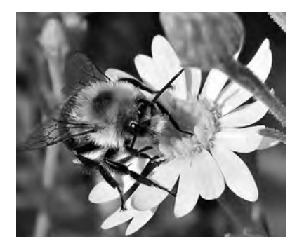
Figure 1. Bumble bee ( Bombus spp.).