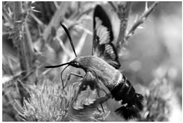
Figure 9. Snowberry clearwing.

Owlet, dagger or underwing moths are of the huge family Noctuidae, which numbers more than 20,000 species worldwide and more than 700 in Missouri (Figure 11). It is by far the largest family of the Lepidoptera in the state. Most noctuids are mediumsized (0.75 to 1.75 inches) and somber gray or dull brown, with a few exceptions of bright color (for example, green marvel, beautiful wood-nymph and grape epimenis). The colors and patterns of