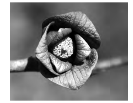
Figure 16. The meat-colored petals and fetid aroma of pawpaw ( Asimina triloba ) attract flies and beetles.

Some people think pesticides are only used for controlling insects. By definition, a pesticide is any product that kills or repels pests. Pests can include weedy plants or plant diseases, animals such as moles, and even household mildews, molds and bacteria. Therefore, products designed for use as disinfectants, toilet bowl cleaners, insect foggers and even pet flea collars are considered to be pesticides. If you are unsure whether a product qualifies as a pesticide, check the package label for pesticide registration numbers issued by the U.S. Environmental Protection Agency (EPA). Pesticide labels carry two EPA registration numbers: the first