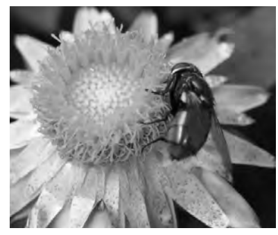
Figure 13. Blow fly, or green bottle fly.

Putrid smelling blossoms are an adaptation to attract certain fly pollinators (Figures 16 and 17). Even male mosquitoes (relatives of flies) get in on the act, pollinating certain orchids. Long-tongued flies (for example, syrphids and bombylids) feed on the same flower types that bees do. Short-tongued flies feed on