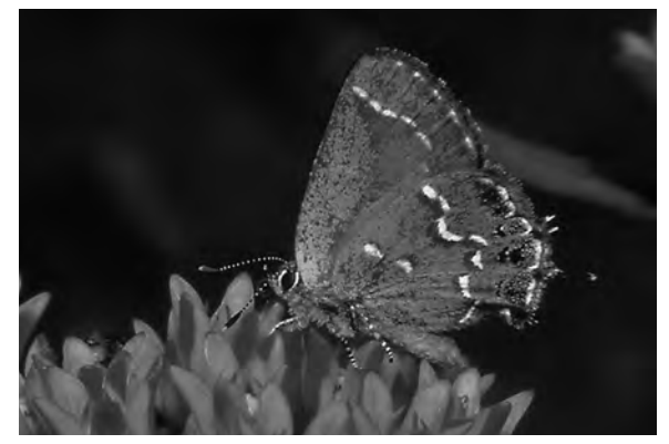
Figure 6. Olive hairstreak.