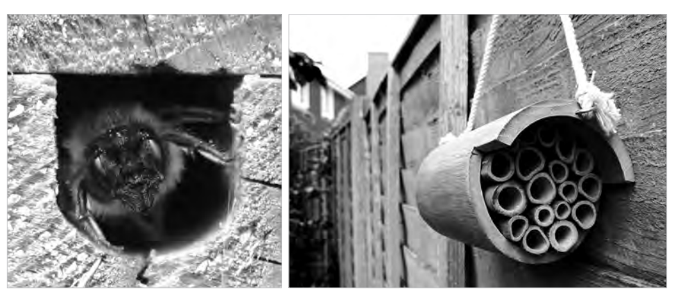
Figure 2. Structures that provide small nesting cavities can attract leafcutter and mason bees to your property.

Visit the bee hotels link in the Resources section to learn how to build a bee hotel.