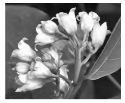
Figure 18. Dogbane.

Figure 17. Jack-in-the-pulpit flowers have a funguslike smell that attracts many tiny insects, particularly fungus gnats.