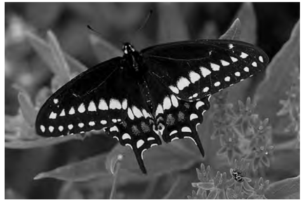
Figure 3. Black swallowtail.

Small butterflies that are commonly blue and gray are called blues and hairstreaks (family Lycaenidae) (Figure 6). Some members of this butterfly group appear as small versions of swallowtails. However, these small butterflies have only thin, hairlike extensions projecting from the hindwings, not the wider, more developed wing extensions of swallowtails. At rest, blues and hairstreaks characteristically hold their wings folded over their backs. In this posture, patches of orange that decorate many species can be observed. Birds often strike color patches or tails, mistaking them