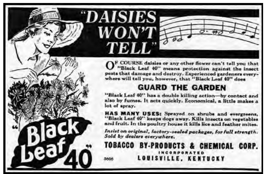
Figure 21. Most of the effectiveness of the old-time insecticide Black Leaf 40 was from nictoine, which is toxic to most insects, including bees.

A notorious misuse of a neonic took place June 17, 2013, in Wilsonville, Oregon, that brought the potential of neonics to kill or harm bees to public attention. The pesticide dinotefuran, also known by the trade name Safari, was applied to 55 blooming linden trees in a