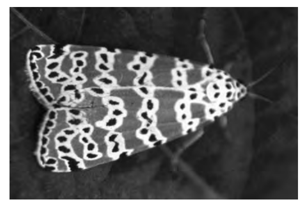
Figure 10. Bella moth.