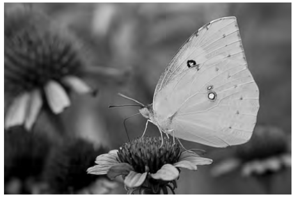
Figure 5. Dogface sulphur.