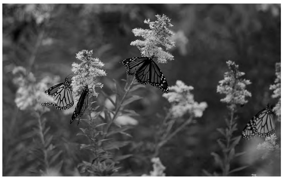
Figure 8. Monarch butterflies.

Milkweed butterflies belong to the subfamily Danainae, in the family Nymphalidae. Historically, this group had been considered a separate family, Danaidae. These butterflies get their name from feeding on milkweed plants. The caterpillars are apparently immune to the toxic juice of the milkweed and consume it voraciously. Thus, both the caterpillars and adults are distasteful to predators such as birds. The monarch butterfly is the most common and familiar milkweed butterfly and is easily recognizable by its bold orange and black color (Figure 8). (The viceroy, a brushfooted butterfly, resembles the monarch but is smaller and has a black line across the hindwing. Male monarchs have an enlarged, dark spot in the middle of each hindwing that give off a scent to attract females.