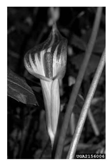
Figure 17. Jack-in-the-pulpit flowers have a funguslike smell that attracts many tiny insects, particularly fungus gnats.