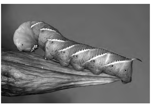
Figure 20. The tobacco hornworm is so large that it is sometimes called the Goliath worm. The distinctive horn at rear of the caterpillar (right) is the source of its common name.

Another example highlights how IPM can solve the conundrum of an insect being both a pest and a beneficial pollinator. Large caterpillars known as hornworms feed on tomato plants and can destroy leaves and fruit (Figure 20). There are two species, the tobacco and tomato hornworm ( Manduca sexta and M. quinquemaculata , respectively), whose adult phases are the desirable and fascinating