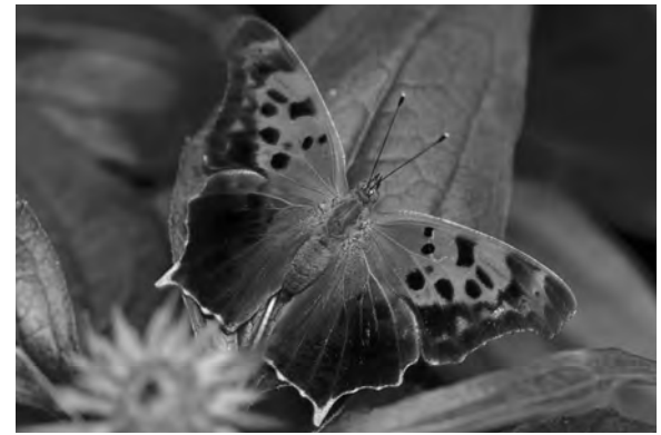
Figure 4. Question mark.