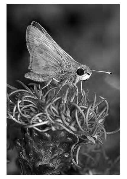
Figure 7. Skipper.

for butterfly heads and allowing the butterflies to escape. Some caterpillars of this family produce a sugary substance called honeydew that is "milked" from the caterpillars by ants. In return for this honeydew, the ants protect the caterpillars from predators. The adult butterflies of this family are seen around flowers growing along roadsides, in fields, and in other open areas.