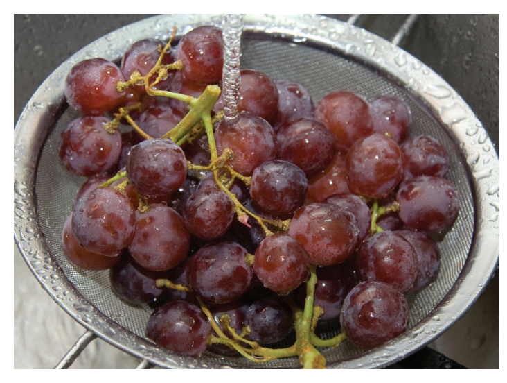
Wash and rinse to be food safe.

When not in season or available fresh locally, you can choose frozen, canned and dried fruit. If you choose to serve juice, make sure it is 100-percent juice, and keep servings small. Fruit juice contains some nutrients, but it is also a concentrated source of sugar and lacks the fiber found in whole fruit. Choose whole fruit over juice whenever possible.