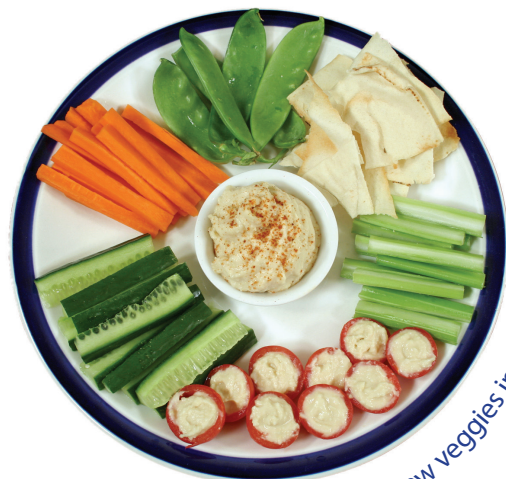
Dip raw veggies in hummus.