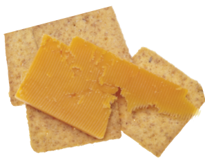
Top whole-grain crackers with low-fat cheese.