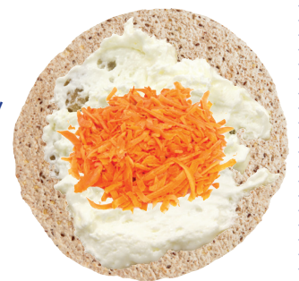
Spread hummus on whole-wheat tortillas and top with shredded carrot.