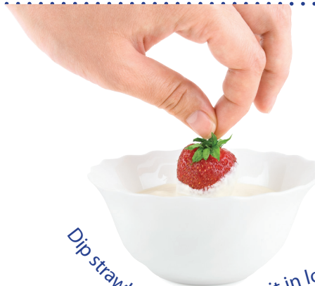
Dip strawberries or other fruit in low-fat yogurt.

What ideas for quick and easy snacks do you have?