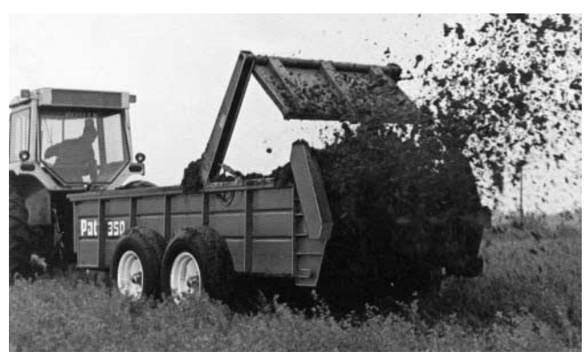
Figure 2. This box-type spreader is equipped with a chain-driven conveyor to move solid manure to the beaters for rear discharge.

The most common equipment for applying solids to the land is a rear-discharge, box-type spreader equipped with beaters that broadcast the manure over a width of several feet (Figure 2). Usually, the manure is conveyed to the beaters at the rear by slats attached at each end to a sprocket-driven chain. Some use a powered front endgate to push the material to the beaters at the rear.