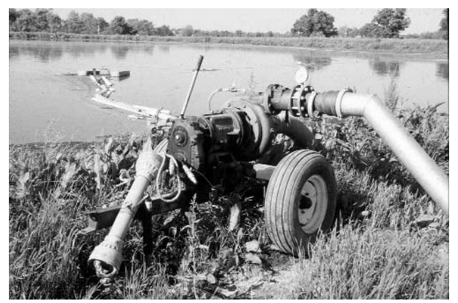
Figure 8. This PTO-powered, high-pressure centrifugal pump fed by a submersible chopper pump, is typical of pumps used with irrigation systems and drag-hose applicators handling slurry manure.

An open-impeller centrifugal pump capable of handling large solids up to 1 inch in diameter may be selected for pumping livestock slurry to minimize clogging problems. Open impeller pumps may handle liquids with solids content up to 15 percent. They often have a sharp rotating blade at the pump inlet to chop large material such as bedding, hay, or silage.