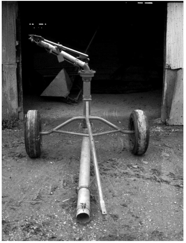
Figure 16. Stationary big gun on wheels to facilitate moving.

<sup>1</sup>⁄<sub>2</sub> to 1-inch range (Figure 14) and typically cover <sup>1</sup>⁄<sub>2</sub> to 2 acres per sprinkler depending on nozzle size and system operating pressure. Although labor input is required, these systems may be applicable for small lagoons (Figure 15).