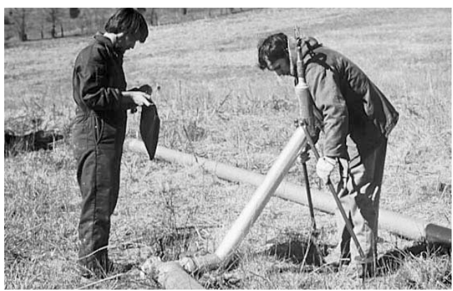
Figure 15. Small hand-set sprinklers require more labor than other systems but may be more economical for small operations.