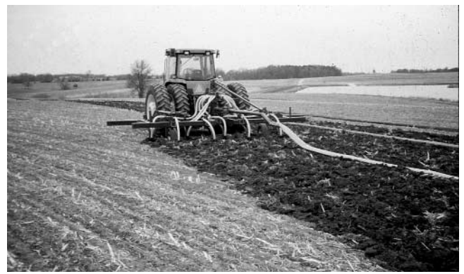
Figure 6. This drag-hose applicator can inject liquid and slurry below the soil surface.