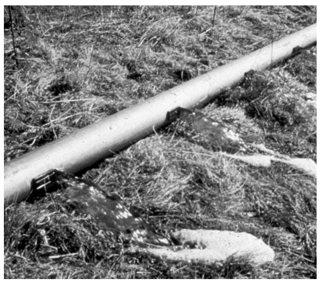
Figure 20. Gated pipe systems are occasionally fed by gravity from a lagoon at a higher elevation.

Solid-set systems throughout a field are generally