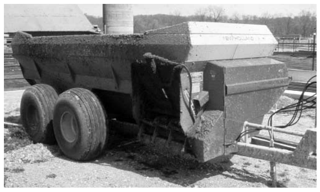
Figure 3. This side-discharge, hopper-type spreader can be used for solid and semisolid manure.