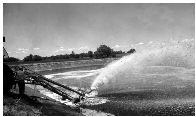
Figure 11. This PTO-powered, high-capacity pump can either fill tankers or bypass effluent to agitate a lagoon, or both.

Table 7 contains friction loss data for portable aluminum pipe with couplings at 30 foot intervals and for PVC pipe. For 20-foot lengths of aluminum pipe, increase values by 7 percent. Table 8 lists recommended pipe sizes for various flow rate ranges.