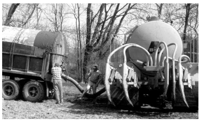
Figure 5B. The self-propelled, tank-type applicator shown in Figure 5A is being refilled from a tender truck.