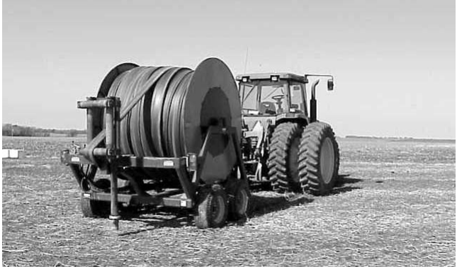
Figure 12. Hose carts provide a compact, fast means to transport, lay out and take up flexible drag hose or feeder hose.

Note: This table provides general guidelines only. Larger pipe size may be required to keep total operating pressure within reason for long lengths of pipeline or large elevation differences between the pump and the application area.