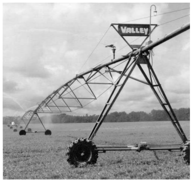
Figure 19. Center-pivot irrigator.

If a lagoon and an irrigation reservoir are located close together, a properly designed pump intake system may allow simultaneous withdrawal of liquid from both the irrigation reservoir and the lagoon. If the irrigation water source and the lagoon are some distance apart, a pump at the lagoon will probably be required to inject the lagoon effluent into the pipe downstream from the