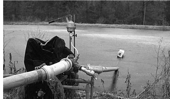
Figure 9. To prevent intake of floating debris, suspend an irrigation pump intake about 2 feet below the surface of a lagoon.

Effluents from manure lagoons, feedlot runoff holding ponds, and milkhouses (less than 4 percent solids content) can often be handled by conventional irrigation pumps and equipment. Large quantities of these wastes are usually encountered in a system. Pipeline transport is most common because it is impractical to transport such highly dilute manure by tank wagon or truck. Single-stage, standard closed-impeller centrifugal pumps work well. Semi-open impeller pumps are sometimes desirable to reduce clogging. Large solids should be screened out at the pump inlet. The screen area should be as large as possible to minimize velocities into