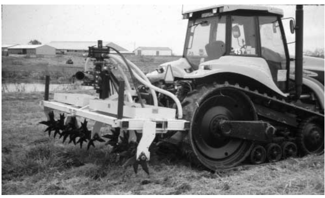
Figure 7. The aggressiveness of this incorporating applicator can be increased by angling the tine shaft.