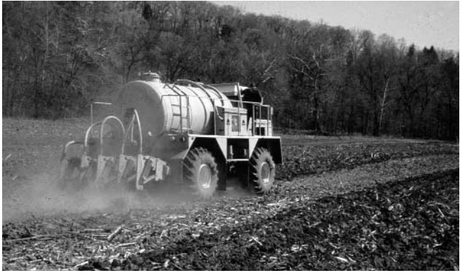
Figure 5A. This self-propelled, tank-type applicator is equipped to inject slurry below the soil surface, thus reducing nutrient losses and odor emissions.