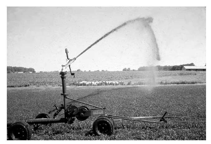
Figure 17. Soft-hose traveling big gun irrigators are frequently the system of choice for land application of lagoon effluent.

Effluent is usually carried from the lagoon to the point of attachment in the field by portable aluminum pipe (Figure 18) or underground plastic pipe. Traveling guns require pressure ranging from 75–120 psi with flow rates from 100–800 gpm. Pressure required at the pump may range from 80–200 psi, normally being higher for hard-hose travelers than for soft-hose traveling guns. Soft-hose travelers than for soft-hose traveling guns. Soft-hose traveling guns usually travel either 660' or 1320' on each set. The hose is a major cost item on a traveling gun. Typical coverages range from 4 acres per set for small traveling guns to 13 acres per set for large traveling guns, depending on nozzle diameter, operating pressure, sprinkler angle and hose length.