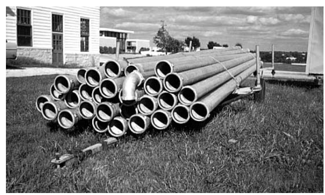
Figure 18. Portable aluminum pipe is available in a variety of sizes for use as a low-friction feeder conduit for irrigators and tractordrawn, drag-hose applicators and injectors.

Large traveling guns are too costly for pumping typical livestock lagoons, unless also used for crop irrigation or for custom application of effluent. A common size irrigates 10 acres per set compared to about 2 acres for a stationary gun. Most manufacturers of traveling guns now make small units that are competitive in cost with the hand-move or stationary big gun sprinklers. These units are adaptable to the rolling terrain often encountered near lagoons and are easily transported.