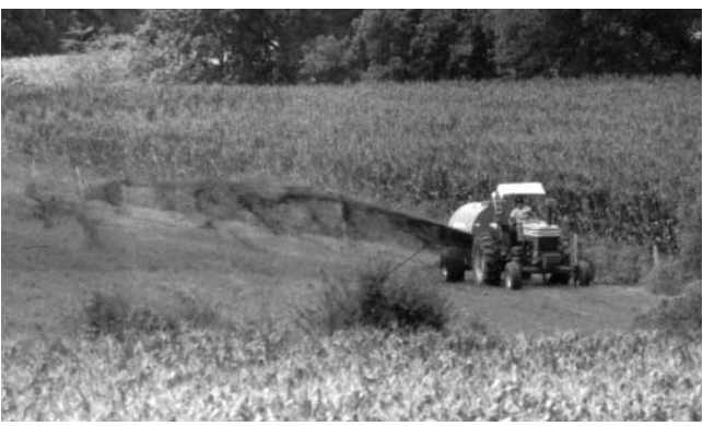
Figure 4. This tank-type applicator is broadcasting slurry onto the soil surface.

Agitation of the manure storage before and during pumping is recommended to reduce the buildup of solids and for a consistent application of sampled nutrients. In the past, most slurry has been transported to the field in tank wagons equipped to either broadcast the slurry onto the soil surface (Figure 4) or to inject the slurry below the surface. Custom operators and large animal feeding operations may use self-propelled applicators, and tender trucks to keep the applicator operating in the field (Figures 5A and 5B). As operations become larger and the potential odor and environmental problems become greater, there is a trend toward injecting or incorporating the slurry with a drag-hose, tractor-drawn applicator (Figures 6 and 7). Injection or immediate incorporation can prevent the loss of ammonia nitrogen to the air. Where odor and erosion problems are minimal, slurry can be surface-applied by sprinkler irrigation with a choice of fixed sprinklers, hand-carried sprinklers, traveling guns or specially equipped center-pivot irrigators. High fiber slurry, such as from dairy and beef animals, may require chopper pumps. Care must be taken not to overapply manure nutrients when using sprinkler irrigation equipment with slurry manure.