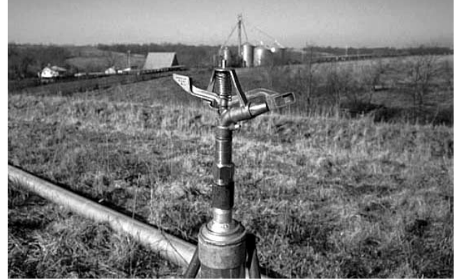
Figure 14. Small sprinklers (up to \frac{3}{4} -inch diameter) can be used to irrigate lagoon effluent onto irregularly shaped fields.