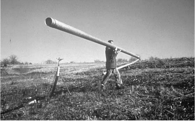
Figure 13. The use of aluminum pipe requires more labor than flexible hose requires.

With a typical system, a <sup>1</sup>/<sub>4</sub>-mile lateral covers 1.8 acres with each 60-foot move; 32 sprinklers can discharge 10 gpm each for a total 320 gpm pumped through 5-inch pipe. The application rate is 0.4 in/hr and the power required is about 20 hp.