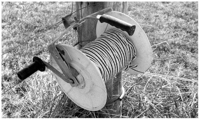
Figure 5. Geared reels for polytape or polywire allow easy installation of temporary electric fences in paddocks.

Reels: The reels are usually locked and hung on a high-tensile boundary wire until the next move. Capacities vary from 300' to 1,320' of polytape and from 660' to 2,640' of polywire. To minimize the electrical resistance and the reel weight, the length of the conductor on the reel should be not be greatly longer than necessary. Two types of locking systems are used, the cog and lever system (positive) and the friction washer type (non-positive). A geared-up reel that has a 3:1 ratio can save time when rewinding of the tape or wire (Figure 5).