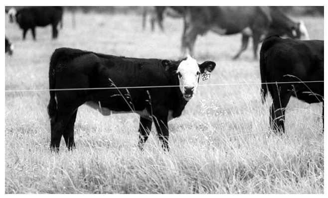
Figure 4. Animals can more easily see polytape than polywire in an electric fence.

Polywire and polytape. For short-term grazing (strip grazing), polywire and polytape are lightweight and easily moved and hand stretched. Polywire looks like colorful polyethylene binder twine laced with several strands (usually 3, 6 or 9 strands) of wire to carry the electrical current. Polywire with 6 or 9 strands of stainless steel wire is most common and can be used for longer runs without excessive voltage drop. Due to the high resistance of these conductors, they are usually used for short runs of less than 2,000 feet. Polywire is easily spliced by tying a knot. Knots in polytape may not make good wire contact. Commercial splice buckles are available, or a \frac{1}{16} -inch lock washer may be used as a connector.