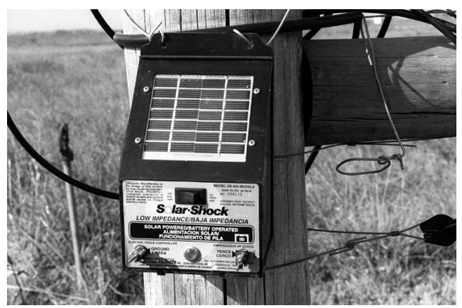
Figure 2. Solar-powered fence energizers use a solar panel to charge a battery.

is approved by Underwriters Laboratories (UL), or the U.S. Bureau of Standards.