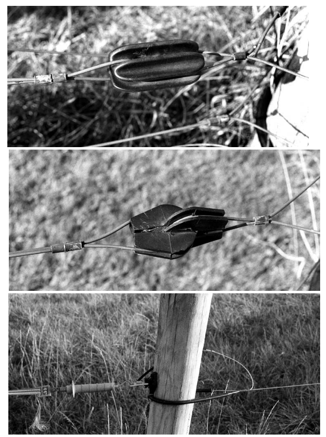
Figure 7. Three types of insulators for corners and ends of hightensile wire fences. (Top) Ceramic. (Middle) Polyethylene or polypropylene. (Bottom) Wrap-around tube-type insulator.

These can be the wrap-around tube-type insulators or double-U or double-hole terminal insulators. Porcelain insulators will work if they are of good quality. Many "farm store" insulators may crack under the strain from hi-tensile wire. Moisture in the crack may cause a short if the tie-off wire contacts a grounded wire. When using the double-hole insulators, be sure the two wires cross over one another to load the insulator in compression. If the insulator is loaded in tension, it can be pulled in half.