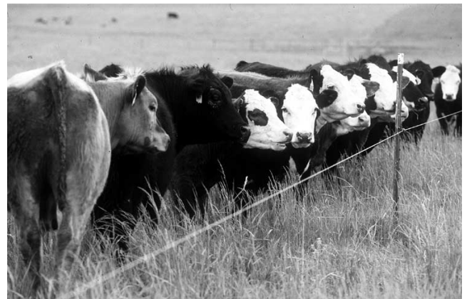
Figure 1. Management-intensive grazing allows sufficient leaf area to remain in a grazed paddock for rapid plant recovery during the following rest period.

To promote proper grazing management, intensively managed grazing systems may be cost-shared by funds from the Missouri sales tax for soil conservation and parks as a water quality enhancement practice.