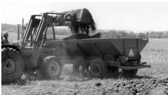
Figure 2. Tractor with front loader moves solid manure to a spreader.

Front-end tractor loaders (Figure 2) can remove manure from large areas with high clearances. Traction and stability can be a problem, although wide front axles can improve stability, and weights on the rear wheels or front-wheel-assist can improve traction. Skid steer loaders can work in cramped quarters and, in general, lessen time and hand labor expended.