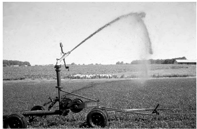
Figure 6. Traveling guns are the usual means of irrigating lagoon effluent onto fields.

To reduce labor and to accommodate larger operations, a traveling gun (Figure 6) or a center-pivot irrigator may be more cost-effective than hand-moved sprinklers. Different models of the small traveling guns are