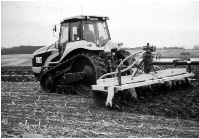
Figure 5. Tractor-drawn drag-hose incorporators and injectors are commonly owned by custom operators.