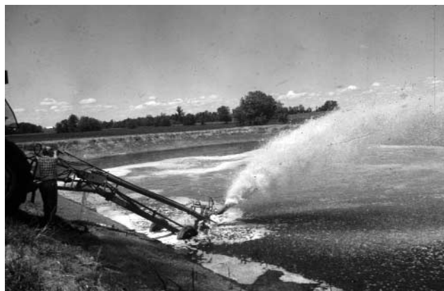
Figure 3. High-capacity pumps can be used to agitate slurry pits and lagoons.

Pumps are frequently used to move manure into tanks and to move manure from tanks into tank wagons. High-capacity pumps (1,000 to 3,000 gallons per minute) are used to remove swine manure from storage, with