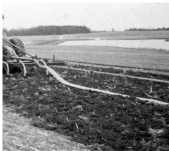
Figure 4. Tractor-drawn drag-hose injectors reduce the odor and nitrogen volatilization associated with land application of manure.

Tractor-drawn drag-hose injectors (Figure 4) and incorporators (Figure 5) reduce the odor and nitrogen volatilization from land application of slurry and lagoon effluent. These units are becoming more common in Missouri and are often owned by custom operators.