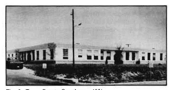
Fig. 2. Taney County Courthouse, 1951-. Architect: Volney A. Poulson

An engineer, Volney A. Poulson, inspired by South American architecture, conceived the plan for a stuccoed building, planned around an open courtyard. The design called for a 116-foot-square structure, with 10foot walks around the perimeter. The building, which still functions as the Taney County courthouse, has 24 rooms, including the jail and a 28-by-40-foot courtroom. Central passageways through the building lead to a 42-foot-square open courtyard (Fig. 2). Built of cinder blocks, stuccoed and painted off-white, the building is heated by hot water carried through copper tubing. The court contracted with George Brown to build it for $66,912.50. A few months later Brown defaulted. A controversy arose with Paulson, who resigned, and work stopped for a time. Construction which began in July 1950, was completed August 6, 1951. Planners considered future landscaping and a fountain to enhance the effect of the courtyard.