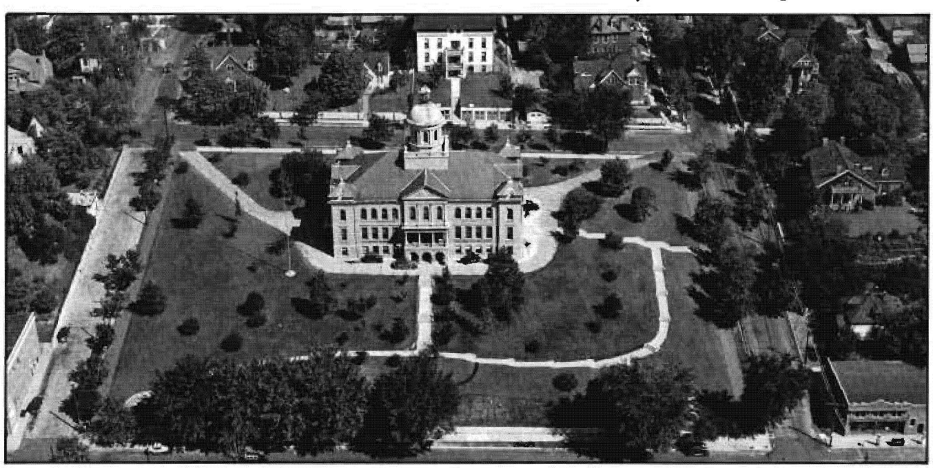
Fig. 3. Aerial view of present courthouse, photo ca. 1935.

Other related Missouri courthouses by Legg were constructed of brick in Gasconade County, built in 1896-98, and Mississippi County, 1899-1901, but the St. Charles stone building is the finest example of Legg's turn of the century courthouse design.