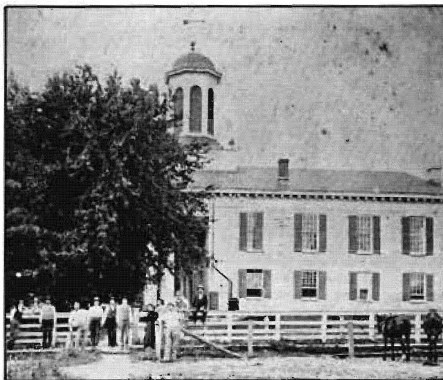
Fig. 1. Ralls County Courthouse, 1858. Designed by Henry C. Wellman, attorney.

The court first appropriated $8,000. Final costs amounted to about $18,000. The court awarded the building contract for $16,400 to Francis Kidwell, who then subcontracted. Three building superintendents were appointed; one resigned, and the court dismissed another. The court accepted the building in 1859 from