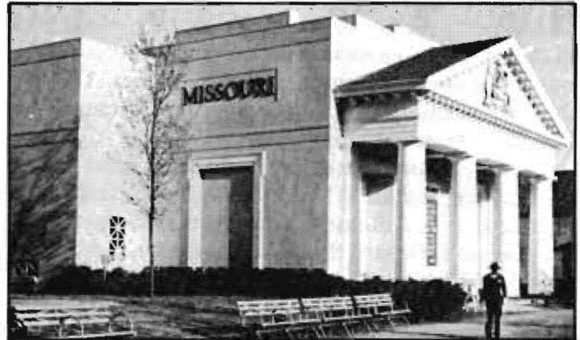
Fig. 3. Replica of Ralls County Courthouse at New York World's Fair, 1938.

Ralls County's courthouse, now listed on the National Register of Historic Places, is one of two 19th century Missouri temple-type courthouses still in use as the official county building. The other, in Lafayette County, dates from 1847.