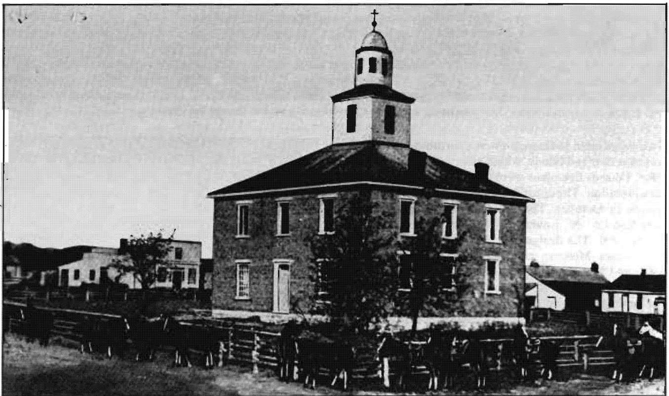
Fig. 1. Polk County Courthouse, 1841-1905.