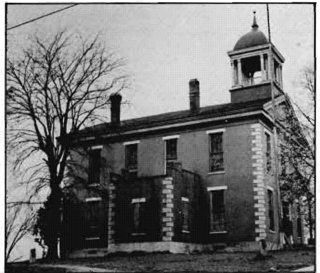
Fig. 1. Phelps County Courthouse, 1859-

At the outbreak of the Civil War, Rolla was recognized as a southern stronghold, but June 14, 1861, the Confederate flag was taken down. Union troops took possession of the courthouse and used it for their base of operation. The courthouse was also used as a quartermaster store and hospital. Fig. 2 shows how the courthouse dominated the Rolla skyline during this time.