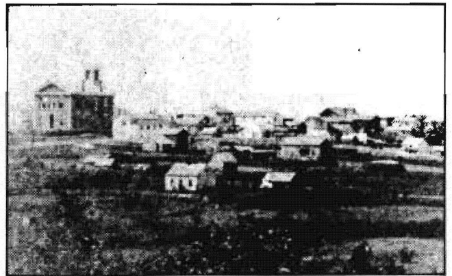
Fig. 2. Photo of Rolla near the time of the Civil War showing dominance of the courthouse.