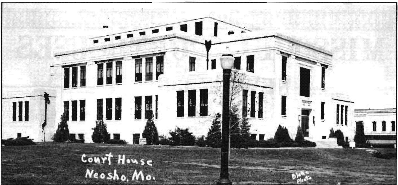
Fig. 3. Newton County Courthouse, 1936-. Architect: Neal Davis

(Fig. 2), but the building continued in use until it was razed in December 1935 as construction began on the present courthouse.