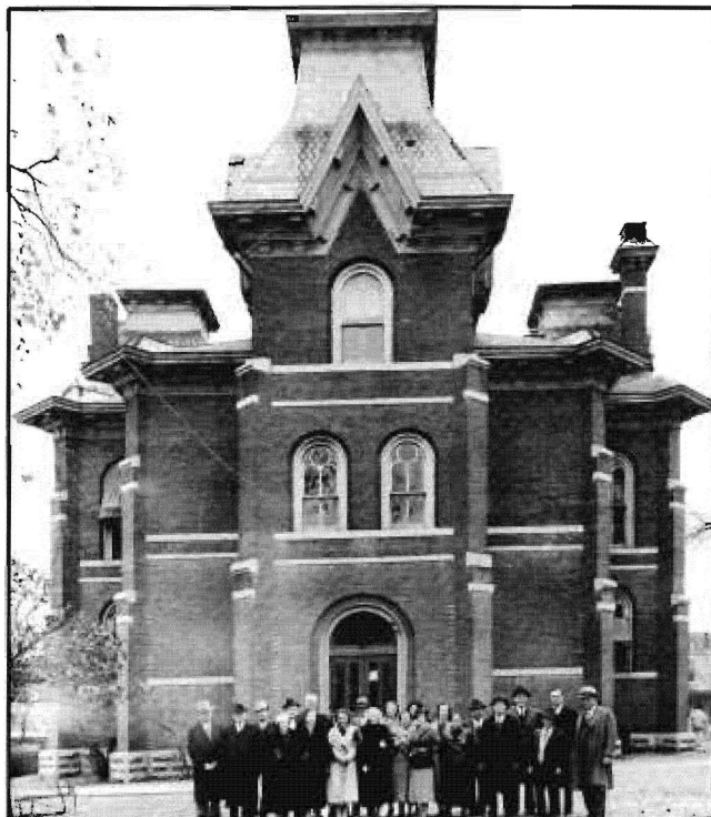
Fig. 2. Newton County Courthouse, after tower removal ca. 1920.