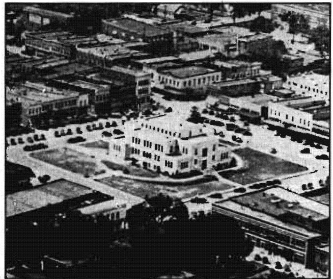
Fig. 4. Newton County Courthouse, 1936-. (From: postcard, Trenton Boyd collection)

Built of Carthage stone, the building consisted of four stories: basement, first floor for general offices, second floor for the Circuit Court room, and top floor for the jail (Figs. 3 and 4). The building measured about