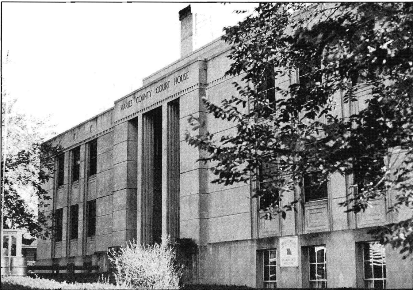
Fig. 2. Maries County Courthouse, 1940-. Architect: Macon C. Abbitt

stone and concrete. About $90,000 was the investment considered: Work Projects Administration funding $50,000, supplemented by a bond issue proposal for $40,000. The following month the Belle Banner urged community support; the editorial cautioned that federal aid would not last forever. County residents voted approval in January 1940.