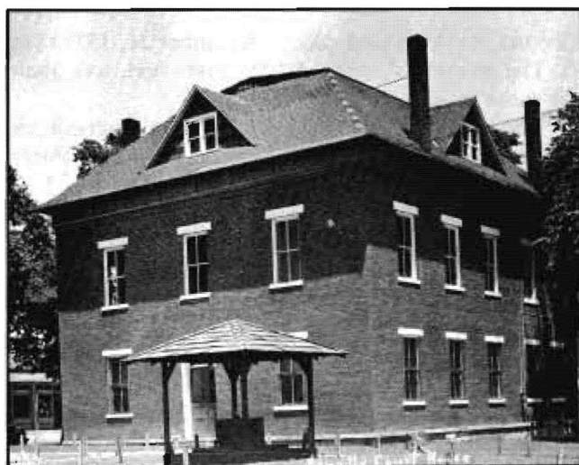
Fig. 1. McDonald County Courthouse, 1870-1978.