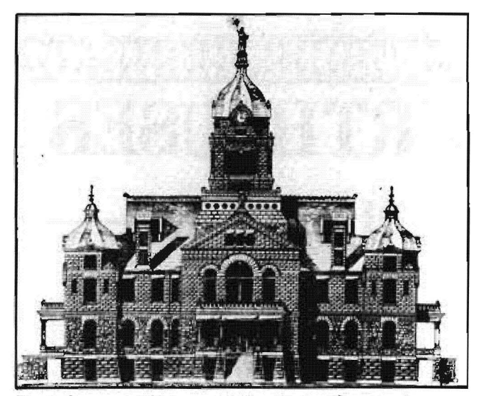
Fig. 3. Proposed 1900 Lawrence County Courthouse. Architect: George Mc Donald (From: Mount Vernon Fountain and Journal. May 24, 1900.)