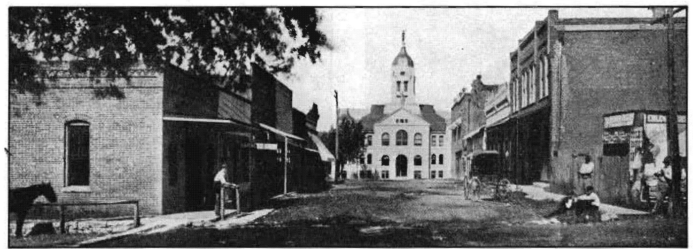
Fig. 5. 1900 courthouse facing Main Street.

shows pier-supported porches on three sides, which were apparently eliminated before construction (Fig. 3). The contract was first let in July 1900 to J. D. Armstrong of Chicago for $48,875. After he forfeited the bond, T. A. Miller, of Aurora, Missouri, received the contract for the 84-by-104-by-82-foot-tall, stone building on November 28, 1900.