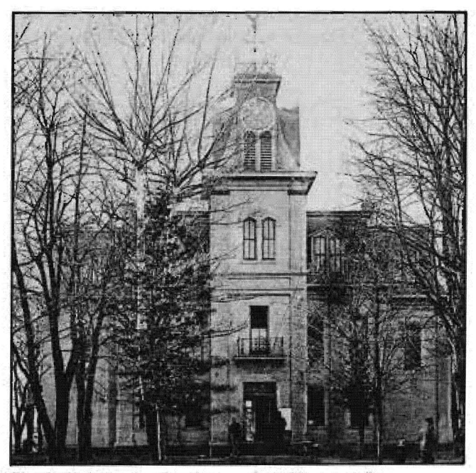
Fig. 2. Holt County Courthouse, after 1881 remodeling.

Some people questioned the legitimacy of the court's action, which took the county so far into debt. They were convinced that the court actually rebuilt under the guise of repair to avoid taking the issue before the county, since voter approval was not required for repair. Their protest resulted in a lawsuit that went to