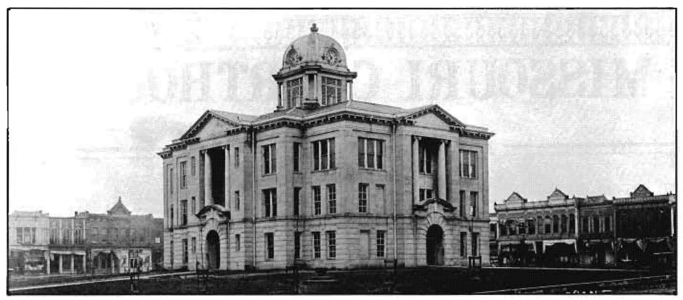
Fig. 2. Daviess County Courthouse, 1906-. Architect: P. H. Weathers

County, 1876, depicts this example at Gallatin, and County Court records supply specifications (Fig. 1).