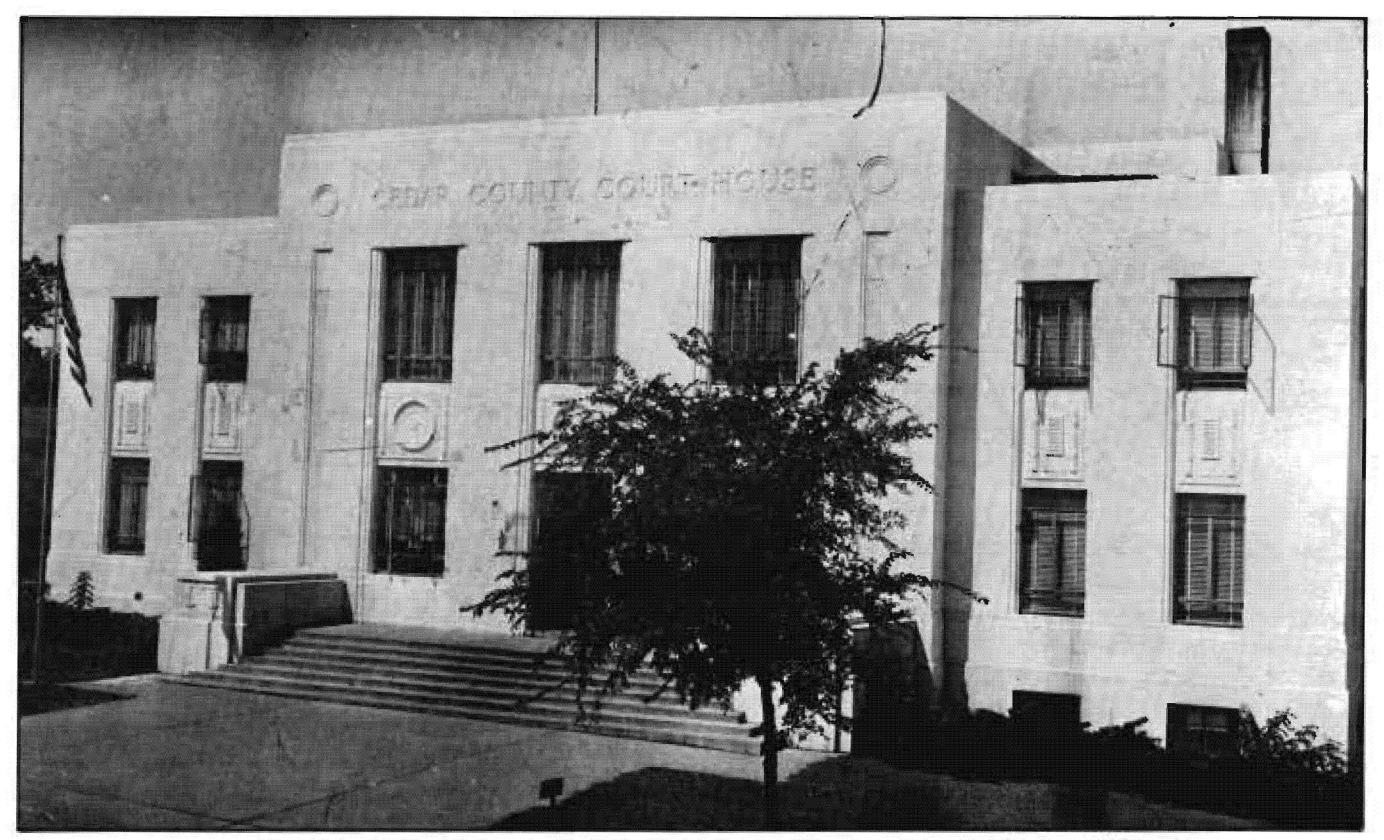
Fig. 2. Cedar County Courthouse, 1938-. Architects: Marshall and Brown

Only two months later, in February 1868, the court issued orders to repair the leaking fireproof roof. In the following months several references indicate continued problems with leaking, and in May 1869 the court appointed James A. Cogle to superintend the repairs and put on an entire new roof, if necessary. Porches were added later. This courthouse continued in use until the 20th century courthouse was built. The court sold the building in 1939 for $100.