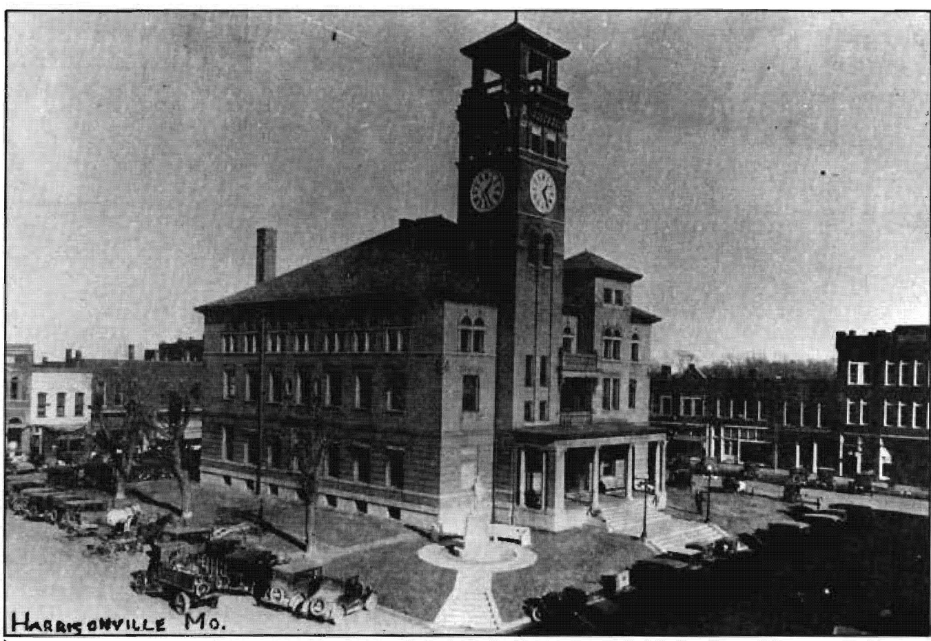
Fig. 2. Cass County Courthouse, 1897-. Architect: W.C. Root

for the building by direct taxation in two years, which they had authorized in an election March 14, 1896. W. B. Harrison superintended construction.