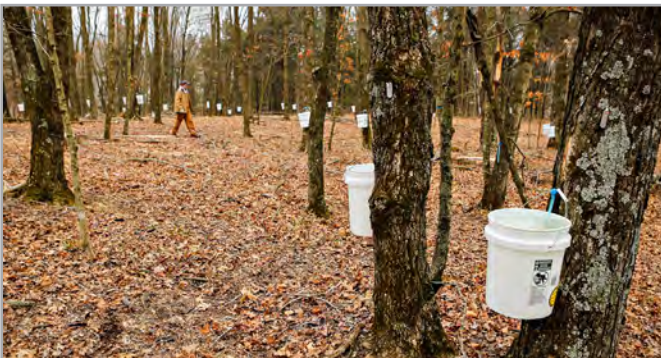
Figure 1. Survey respondents produced 480 gallons of syrup in 2022.

This guide aims to assist existing and new tree-sugaring enthusiasts with an interest in selling locally-made syrup by covering the basics of product marketing. The guide is structured around four marketing principles: product, pricing, place and promotion.