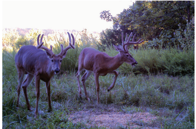
Figure 1. To determine the composition of the deer herd on your property, count and accurately classify every deer seen during each outing.

Emily Flinn , Resource Scientist, Missouri Department of Conservation