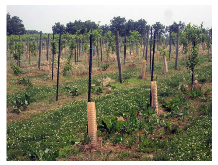
Figure 3. Plastic tree guards or tubes protect young seedlings, shrubs or newly planted vegetation from rabbits.

18- to 24-inch-high cylinder of ¼-inch mesh hardware cloth set into the ground around the trunk to prevent gnawing damage to the main stem or trunk (Figure 3). Multistemmed shrubs should be encircled with hardware cloth or 1-inch wire mesh. You can also use plastic guards or tubes to protect newly planted woody shrubs, trees or fruit crops (Figure 4). These can also be used to protect valuable plants from deer as well as rodents, such as meadow and prairie voles. For more temporary protection, you can use flexible polypropylene netting, galvanized poultry wire or various types of paper, plastic or tinfoil wraps.