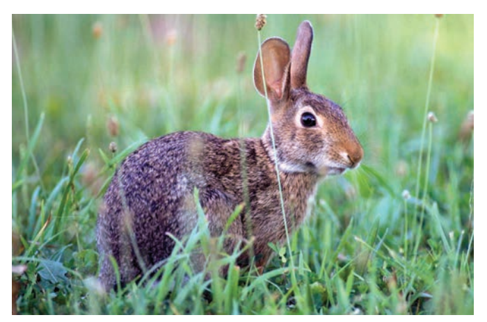
Figure 1. Cottontail rabbits are a valuable game species in Missouri, but in some cases they can be a nuisance by damaging plants, garden crops and newly planted seedlings.

Robert A. Pierce II, Fish and Wildlife State Specialist, School of Natural