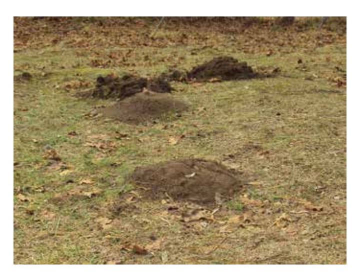
Figure 4. Moles can can be a nuisance and cause damage to lawns and turf grasses by their tunneling activity and pushing up soil into mole hills.

Review plans and eliminate features that would attract nuisance wildlife. Examine your proposed land-use plans, landscaping layout or building design for their potential to provide any of the important habitat components — food,