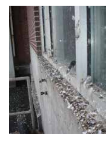
Figure 3. Pigeon droppings can be a health hazard.

Other control options to reduce wildlife damage should be tried before shooting is initiated. Before