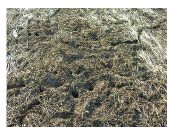
Figure 5. Small rodents, such as the prairie vole, can damage trees, fruits, vegetables and row crops by their feeding and tunneling activity.

water, cover, space — that would attract nuisance wildlife in your area.