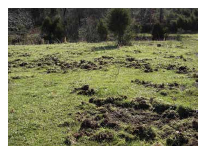
Figure 2. Feral hogs can damage a pasture or field by their rooting activity.