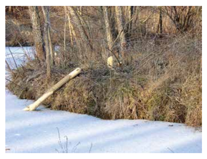
Figure 1. Beavers can damage or kill trees and cause problems when their dams flood timber and bottomland crop fields.

Seth Swafford, Missouri State Director, USDA APHIS Wildlife Services