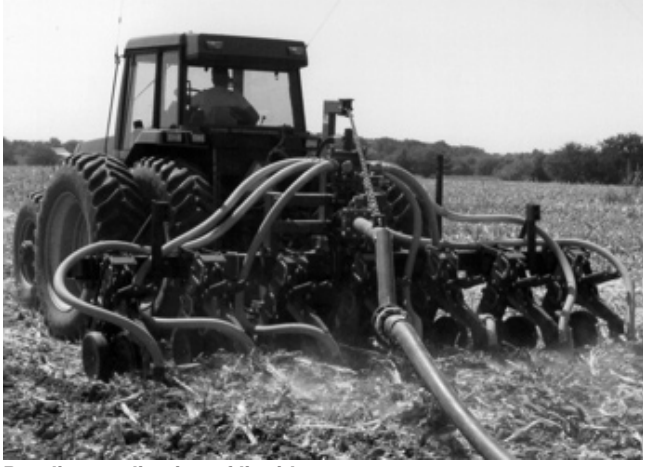
Dragline application of liquid manure.

This is the estimated amount of nitrogen that will be released from the lagoon effluent in the second year after application.