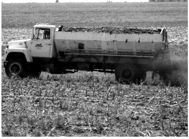
Truck-mounted applicator of solid manure.