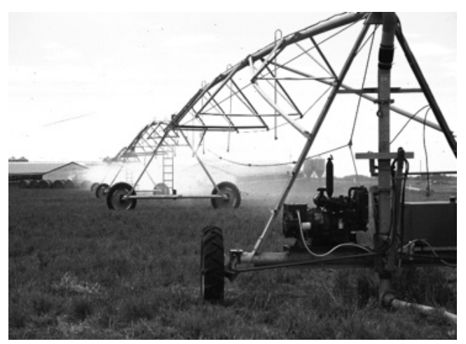
Center-pivot irrigation system for applying liquid manure.