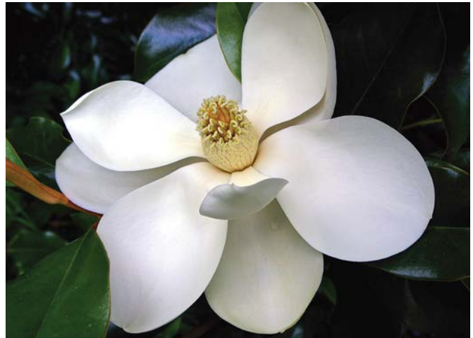
Figure 1. Southern magnolia is one of many broad-leaved evergreens popular in Missouri.

Poor culture, attacks by insects or disease, or any other factor that weakens a plant makes it more subject to winter injury.