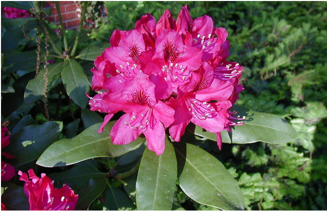
Figure 3. Rhododendron catawbiense , 'Nova Zembla,' is one of the hardiest evergreen rhododendrons.

in other areas of the state should be used as a large shrub, although it will eventually develop into a small tree.