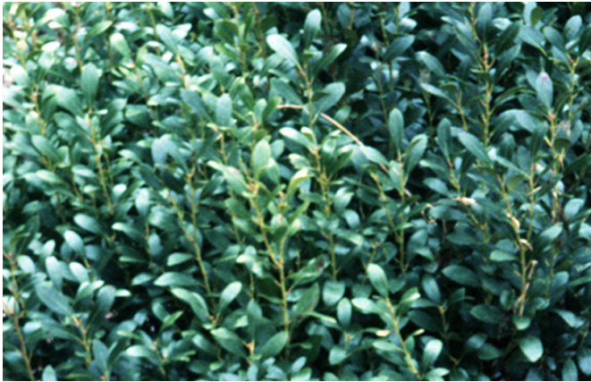
Figure 5. Inkberry is among the hardiest of the hollies.