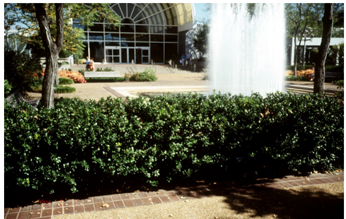
Figure 4. 'Blue Prince' holl will grow 8 to 12 feet high but can be pruned into any shape.

This slow-growing plant with spreading, arching branches and dark lustrous leaves produces fragrant, bell-shaped flowers in early spring. Drooping leucothoe needs shade for best growth and therefore is most suitable beneath large evergreens. It is related to Japanese andromeda and requires the same growing conditions.