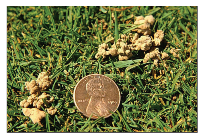
Figure 3. An excellent indicator of a healthy soil is the presence of earthworms or earthworm castings.

Applying carbohydrates and proteins, ingredients usually not included in many synthetic fertilizers, is part of a "feed the soil" philosophy. Maintaining a balanced, healthy soil system ensures that the essential nutrients we apply are used efficiently (Figure 3).