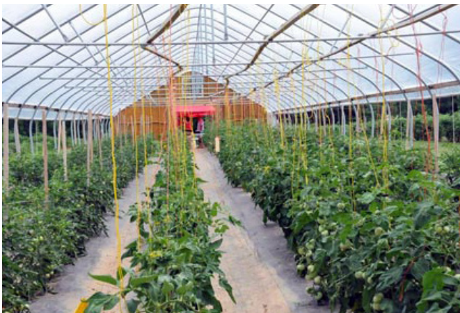
Figure 1. A high tunnel is a low-cost, solar-heated greenhouse that can extend the growing season of vegetables such as tomatoes.

Drip irrigation is the most efficient method of delivering water and nutrients to high-tunnel tomatoes. Plants are watered slowly through a small, 3/4-inch-diameter collapsible tube without wetting the foliage. Drip tape, usually 8 to 10 millimeters thick, is buried 1 to 2 inches deep. Dripper or emitter spacing is typically 4 to 12 inches. Tomatoes require a single drip line per row, offset about 2 inches from the plant. Flow rates of drip tapes vary. Most growers choose a medium-flow tape, which delivers half a gallon per minute (gpm) per 100 feet. High-flow tape, which delivers 0.8 to 1.0 gpm, is useful for preventing clogging and reducing irrigation time (Table 1).