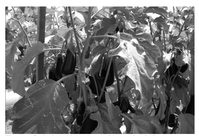
Figure 2. Staked eggplant plants with growing fruit.

growth. Plants can be spaced 18 to 36 inches apart with rows 4 to 5 feet apart. Eggplant can also be planted in twin rows with 18 to 36 inches between plants and between rows on raised beds 3 to 4 feet apart on center.