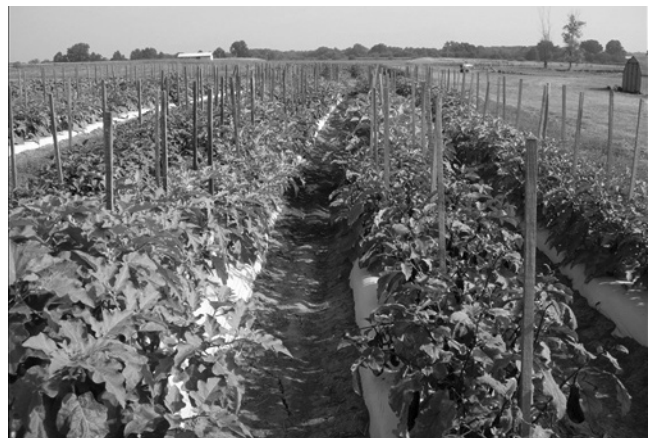
Figure 3. Staking eggplants improves marketable yield and quality.

Harvest: Generally speaking, first harvest of eggplants begins 65 to 90 days from transplanting. Eggplants should be harvested when the fruit surface is glossy and tender and before seeds within the fruit become brown. Overmature fruit have a dull, bronze appearance and the seeds become bitter. Fruit should be clipped from the plant, leaving about 1 inch of stem rather than pulling the fruit from the plant. Harvest may be done two to three times a week during peak growth, depending on the fruit size desired. Failure to