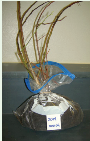
Regular sample packaging. Enclose roots and soil in a plastic bag before shipping.

Delays in mailing can cause deterioration of plant samples. Mail samples early in the week to avoid delaying delivery over a weekend. For highly perishable items, always consider overnight delivery.