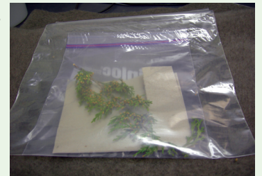
Regulated pest packaging. Double-bag samples of regulated pests.

Place the double-bagged sample inside a sturdy box, and add packing material to reduce movement. Seal all seams of the box with packaging tape. Samples should be hand-delivered or sent by overnight delivery to the clinic. As a last step, notify the clinic that a package of regulatory concern has been shipped.