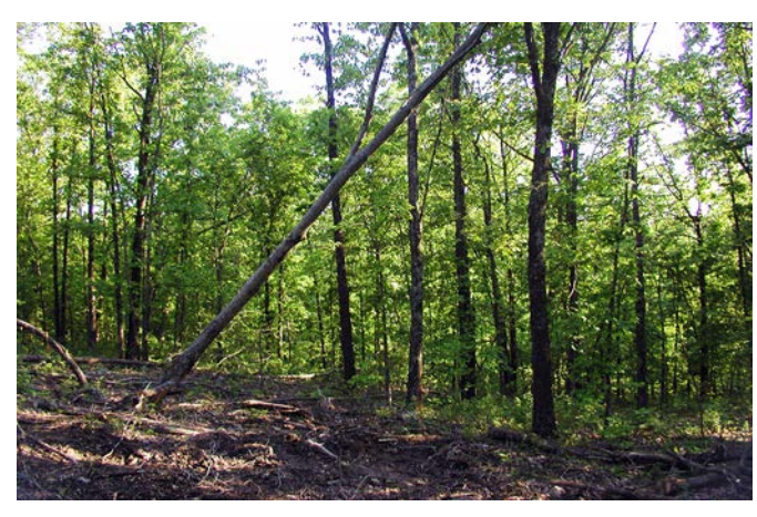
Figure 5. For your safety, and to avoid future liability issues, the contract should require the buyer to drop all hanging trees to the ground.

46. All tops, cull logs and other logging residues must be removed from streams, watercourses, roads, trails, fields and fences prior to completion of harvesting activities.