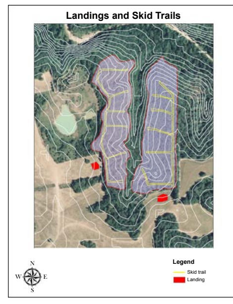
Figure 4. A harvest plan map showing the location of skid trails and log landings should be included in the contract.