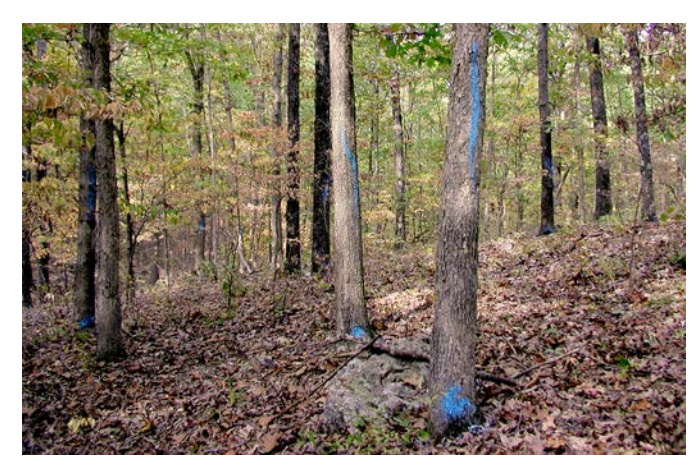
Figure 2. A common practice for marking trees for harvest is to paint them with a specified color on both the trunk and the stump.