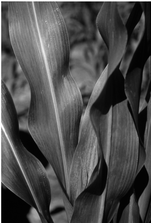
Figure 6. Mottling, yellow leaf with light green areas due to maize dwarf mosaic virus.