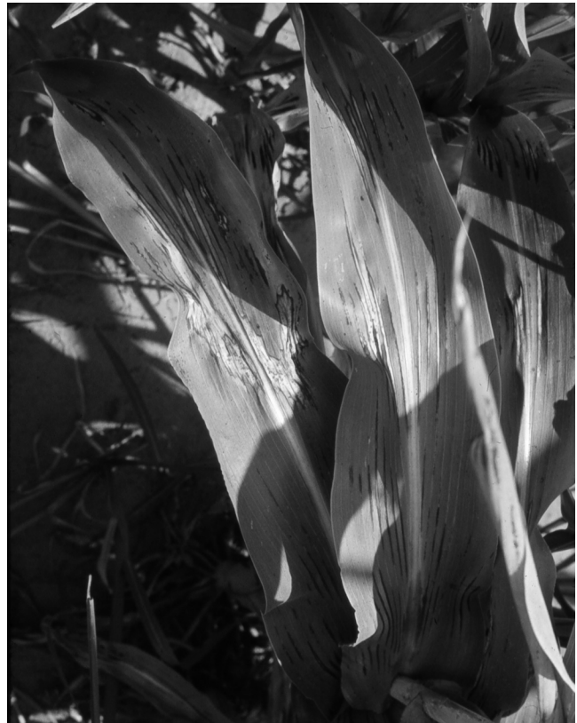
Figure 2. Leaf injury due to bacterial streak.

Leaf blight, target spot, gray leaf spot, zonate leaf spot, rough spot, sooty stripe and rust are some of the leaf diseases of grain sorghum caused by fungi (Figures 3 and 4). These diseases and the symptoms they cause