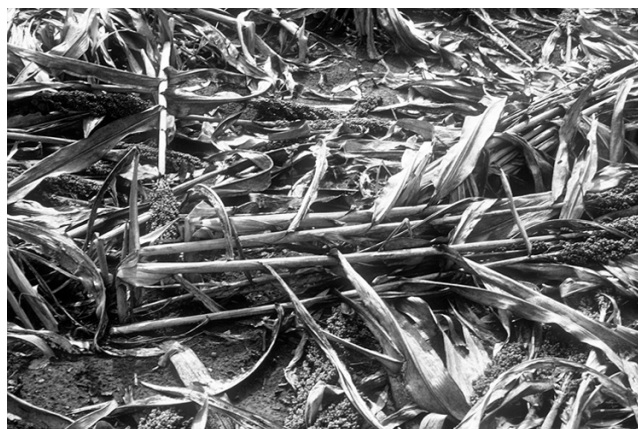
Figure 7. Charcoal root rot causes lodging of plants.