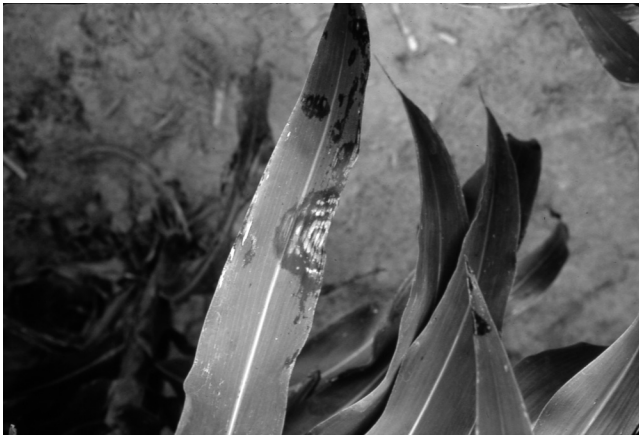
Figure 4. Target-like lesion on leaf due to zonate leaf spot.

are listed in Table 1. The symptoms you see in the field may vary slightly from the symptoms described here due to the weather and the hybrid.