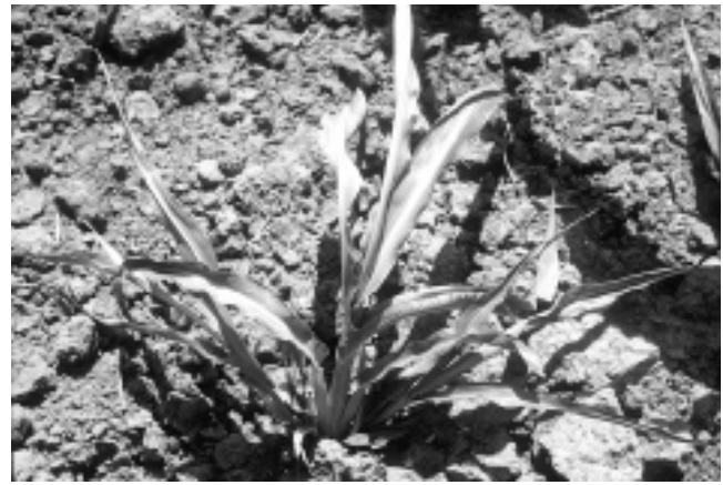
Figure 5. Puckerred, rolled leaves and excessive tillering are symptoms of crazy top.

Sorghum downy mildew, caused by Peronosclerospora sorghi , was first reported in Missouri in the early