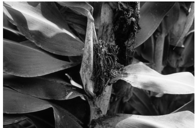
Figure 9. Deformation of grain sorghum head due to head smut.

Head molds are common in Missouri, especially when rainy weather occurs after maturity. Several different fungi grow in glumes and grain surfaces, causing the heads and seeds to appear moldy. The fungi that cause head molds ( Alternaria , Curvularia and