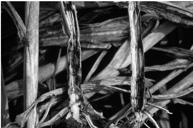
Figure 8. Red discoloration of stalk pith due to Fusarium stalk rot.