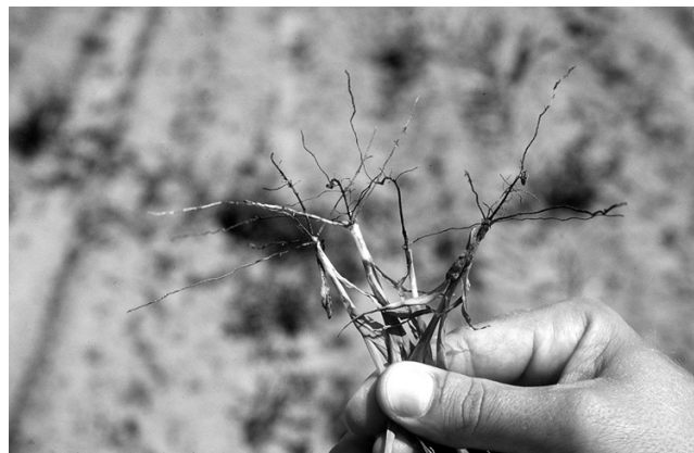
Figure 1. Black roots are an indication of seedling disease in grain sorghum.

Every year, seed and seedling diseases of grain sorghum are common in Missouri. When severe, these