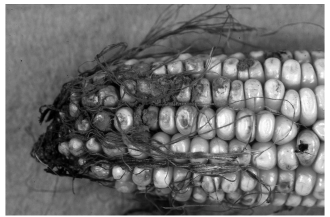
Figure 1. Aspergillis flavus can appear as a powdery mold growth on or between corn kernels.

the kernels, and wind storms may also be predisposed to infection by A. flavus .