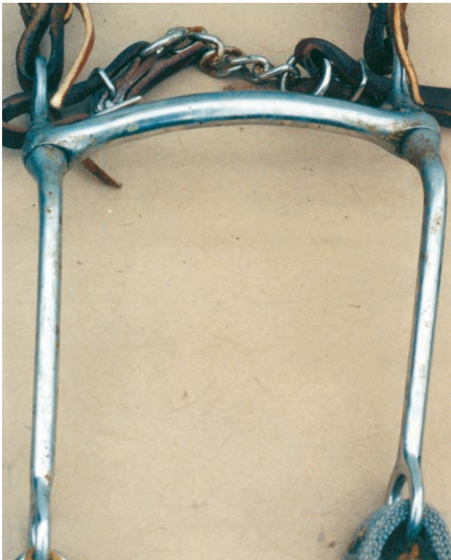
Figure 3. Mullen-mouthed curb bit.