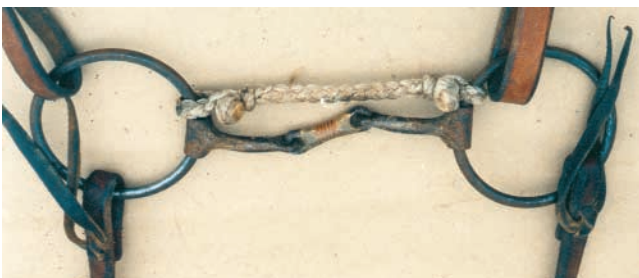
Figure 5. Ring snaffle with three-piece mouthpiece.

led rein points to the right side of the horse.