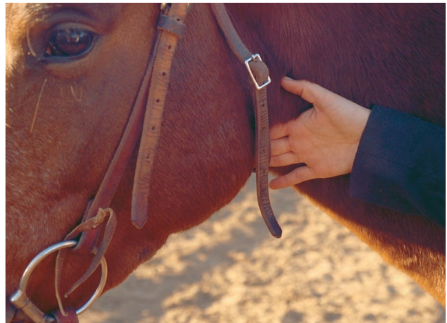
Figure 9. Adjust the throatlatch for adequate room for hunting, jumping and other activities that require raised head carriage.

Once the bridle is off, slip it into carrying position on your arm. Replace the halter and remove the reins from the horse's neck.