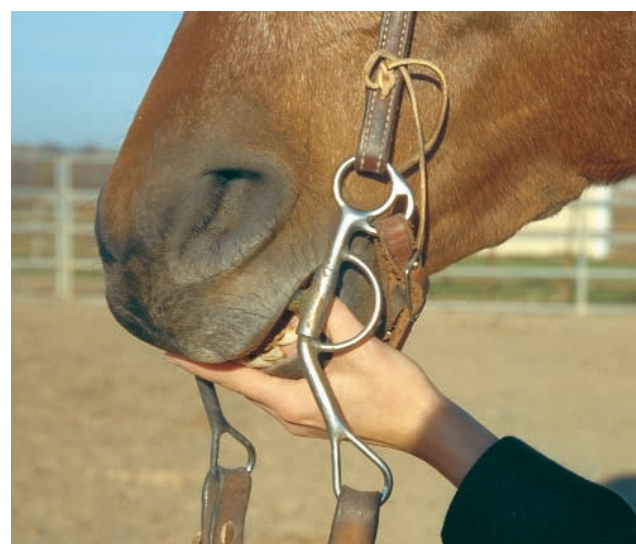
Figure 7. To get the horse to take the bit, you may need to insert your thumb in the horse's mouth behind the incisors.