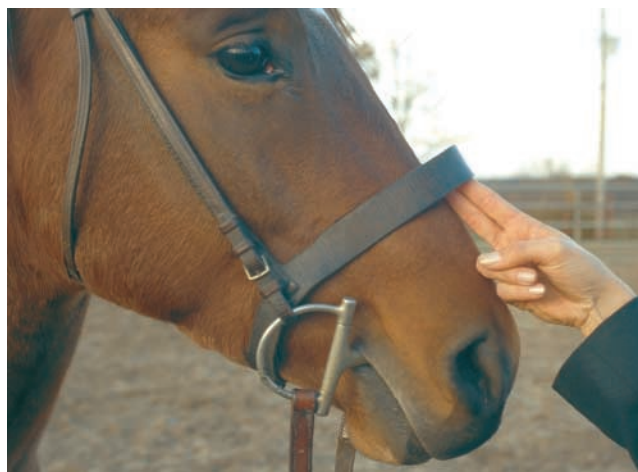
Figure 8. Adjust the noseband two fingers larger than the muzzle.

Many Western nosebands are attached too low on the headstall for use with a tie-down. In this position, the noseband can injure the horse if attached to a tie-down. However, if you think such a noseband is attrac-