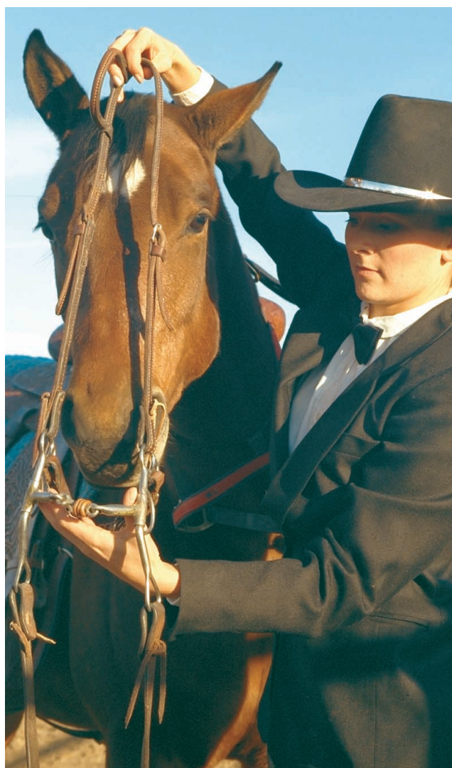
Figure 6. To maintain good control over the horse during bridling, place your right arm around the horse's neck and up between the ears to grasp the crownpiece of the bridle

Holding the bridle up with one hand leaves the other hand free to slip it onto the head. Fold the ears forward carefully one at a time. Slip them gently under