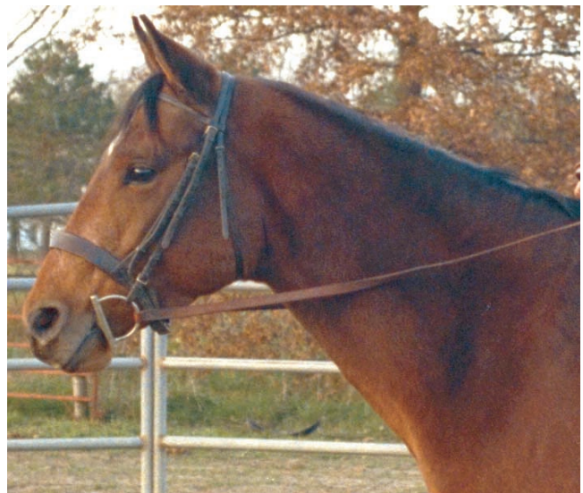
Figure 1. A bridle consists of a bit, reins and headstall.

If the bit is too wide, the mouthpiece protrudes beyond the lips. It will slide back and forth in the horse's mouth and result in confusing rein signals. Also, if the mouthpiece is jointed, it will put extra pressure on the outside corners of the bars and cause pain.