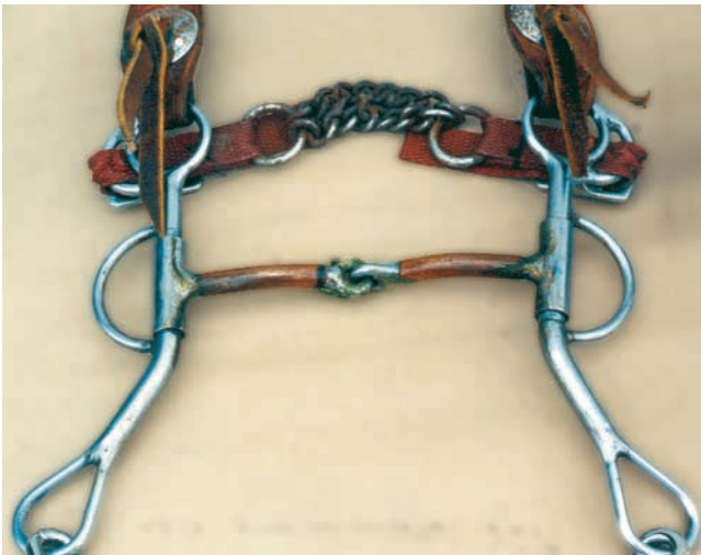
Figure 4. Jointed-mouthpiece curb bit.