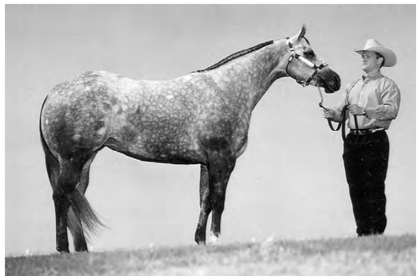
Figure 3. Long, sloping shoulders; short, strong back; long underline; and a long croup increase the probability that your horse can become a good "athlete."

shock absorption when the horse is in motion. Bones should be of adequate size and should show definition of joints and appear flat when viewed from the side.