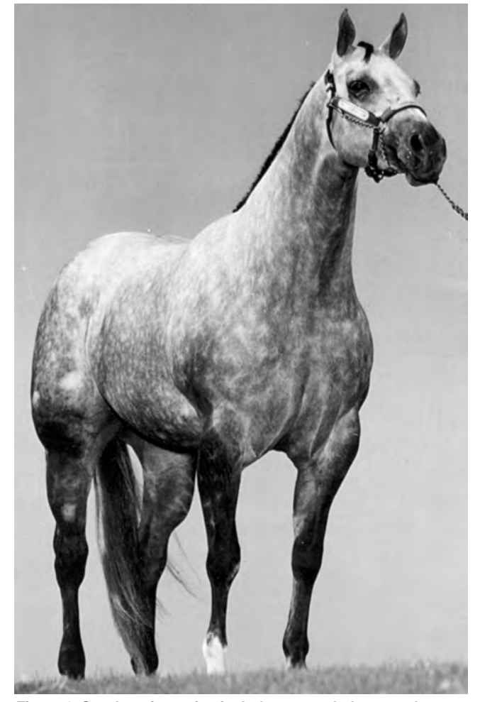
Figure 1. Good conformation includes proper balance and mass, structural correctness, and desirable breed and sex characteristics.

A horse's muscling should be long patterned and defined. Muscle mass can most easily be determined