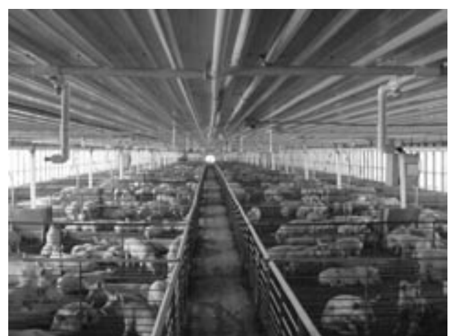
Filgure 2. Oil distribution piping and nozzles.