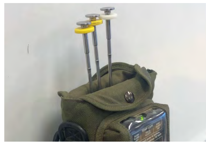
Figure 3. Catheters in a warmer prior to being prepared.

The AI catheter should be warmed prior to straw insertion to avoid cold-shocking the sperm. An electric AI catheter warmer can be used to warm catheters before loading. Electric AI catheter warmers (Figure 3) can also be used to maintain thermal protection of loaded catheters after they are prepared. If there is not an AI catheter warmer available, catheters can be tucked inside a shirt and maintained at body temperature until the straw is ready to be inserted. In addition, catheter sheaths can also be tucked into a shirt to keep warm if it is cold outside.