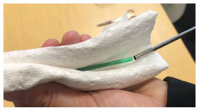
Figure 5. Inserting the cotton plug end of a dried thawed straw into a warmed AI catheter.