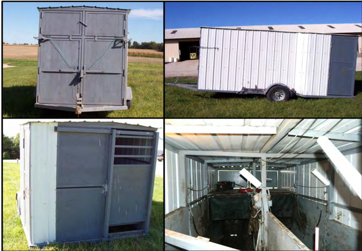
Figure 4. Portable breeding barns available through University of Missouri Extension can facilitate an artificial insemination program. Barns can be backed up to a lead-up alley. A sliding rear door allows for cattle to enter. Two-stall breeding barns can allow for two technicians to perform artificial insemination of two cows simultaneously, speeding up the breeding process in large herds. When AI is completed, pulling a cable opens a front door, allowing cattle to exit.

The barns are floorless and are raised or lowered by a built-in hydraulic pump, allowing cattle to keep their feet on the ground instead of stepping up onto a chute platform. Cattle enter through the sliding back door. The breeding barns keep cattle quiet with little restraint,