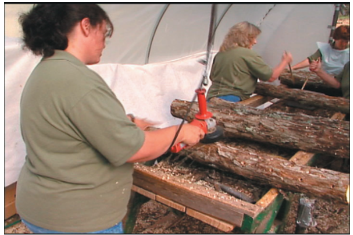
Holes are drilled in cut logs using an extremely high-speed drill.

Logs cut from healthy trees are inoculated with shiitake spawn inserted into holes made in the