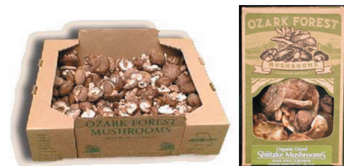
Fresh shiitake mushrooms harvested from Ozark Forest Mushrooms are packed in cardboard containers for delivery to chefs and restaurants, left inset. Top and right inset: Value-added dried mushroom mixes are paired with locally grown rice for an attractive and consumer friendly retail product.