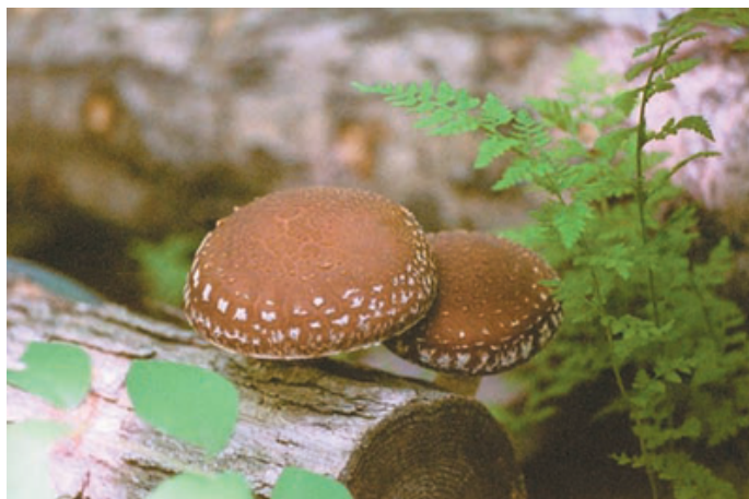
Shiitake mushrooms cultivated on a log

Cultivating shiitake mushrooms represents an opportunity to utilize healthy low-grade and small diameter trees thinned from woodlots as well as healthy branch-wood cut from the tops of harvested saw-timber trees. When the mushrooms are collected and marketed, the result is a relatively short-term payback for long-term management of wooded areas.