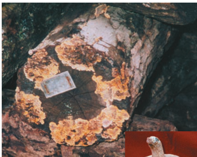
Above: Stereum (a contaminating wood decay fungus) fruiting on log end between rows of inoculation sites. Inset: Snail feeding on shiitake cap.

demonstrations of a successful forest farming practice is Ozark Forest Mushrooms near Eminence, Mo. Dan Hellmuth and Nicola McPherson established the mushroom operation in 1990 in the midst of what was then a timber operation. Together with a small staff, they coordinate every step of the value-added process, from procuring the logs to packaging consumer friendly, locally produced mushroom products.