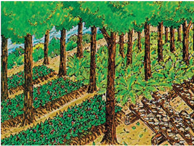
In this forest farming practice, shiitake and other forest farming products, such as ferns and ginseng, are grown under the shade of trees.

are often termed non-timber forest products. However, to accomplish this, forest canopy densities must be controlled.