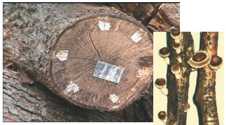
Above: The mycelium is often visible at the ends of logs after spawn run. The rows of inoculation holes were spaced too far apart in the log above to effect complete colonization. As a result, undesirable colonization by competing decay fungi may result. (See box page 5 .) Inset: Inoculated and fully colonized logs at the fruiting stage.

Mushrooms are often called fruiting bodies because they are the site of spore production by the fungus. The mushroom stem serves to elevate the mushroom cap into the air; the cap serves to protect the developing gills; and the gills provide an extensive surface on which myriad spores are produced. Mushroom spores are sexual propagules of the fungus species, and therefore are highly variable. This is why