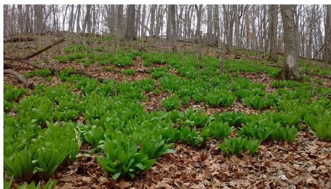
Top: An alley cropping system; Bottom: Ramps in a food forest system.