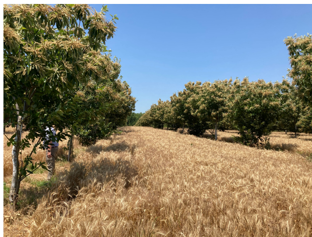
Chestnut and wheat alley cropping system

Economic analysis is not meant to be - nor is it designed to be - a one-time activity. Economic analysis is designed to be a road map for a dynamic and living system. Reassessment takes the information gathered in the economic analysis and combines it with other information to change the original goals or fine tune the design so that it is more successful at meeting those goals. Reassessment is the continuous loop that helps redefine goals, adjust designs and modify indicators. Economic analysis is just one part of the reassessment loop.