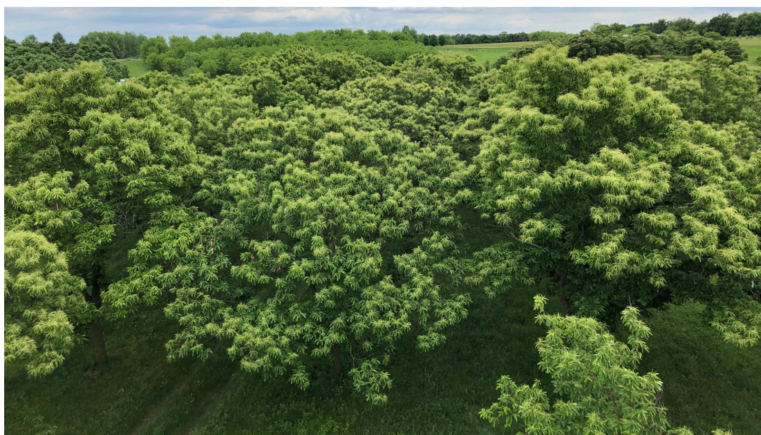
An aerial view of the chestnut planting at the Horticulture and Agroforestry Research Farm in New Franklin, MO

Check out more resources on the " Mizzou Agroforestry " YouTube channel!