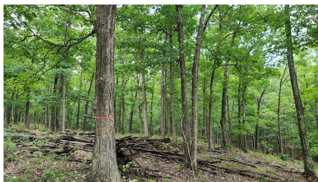
Woodland thinned for silvopasture