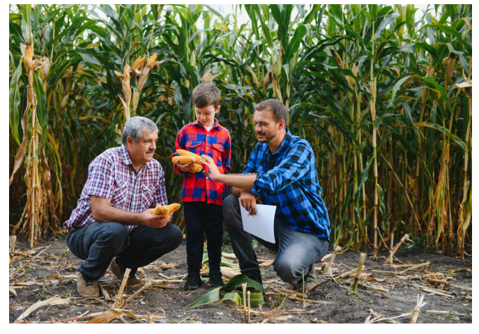
Figure 1. Involving family members in farm decision-making can better prepare the next generation to actively contribute to the farm's viability.

Families who don't communicate may be in denial that conflict exists or may be stalling because they lack information or resources needed to address conflict. Refraining to communicate may also be a coping method for people who prefer to avoid family conflict, struggle with the financial implications of farm transfer or fear giving up control.<sup>2</sup>