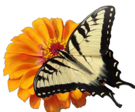
Eastern tiger swallowtail