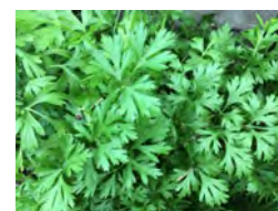
Parsley for black swallowtail caterpillars