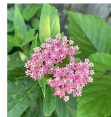
Milkweed for monarch caterpillars