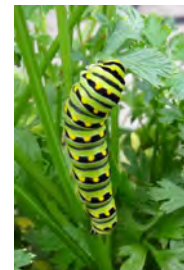
Black swallowtail caterpillar