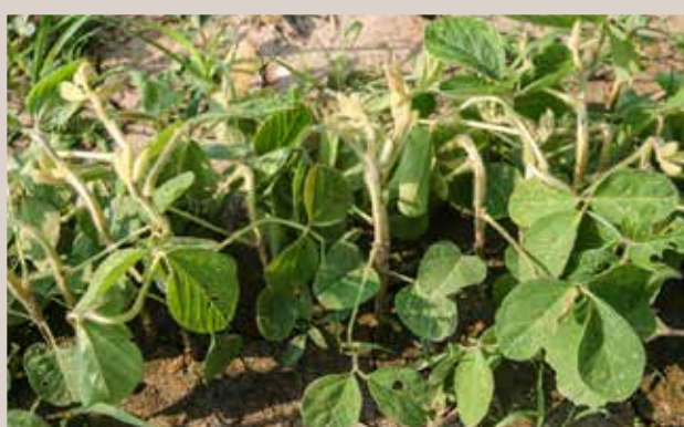
Figure 2. Soybeans that have been injured by off-target movement of 2,4-D. Notice the twisted stems and petioles.