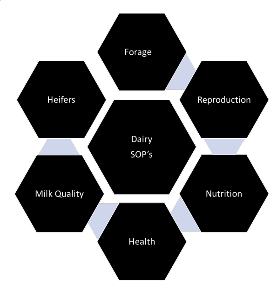
Exhibit A2. Dairy standard operating procedures (SOPs).

Well-managed smaller dairy operations succeed financially when family living withdrawals from the business are modest, capital investments are appropriate and debt levels are low. A dairy producer with a strong equity position, tight operating expense control and family labor committed to high production goals helps generates financial sustainability.