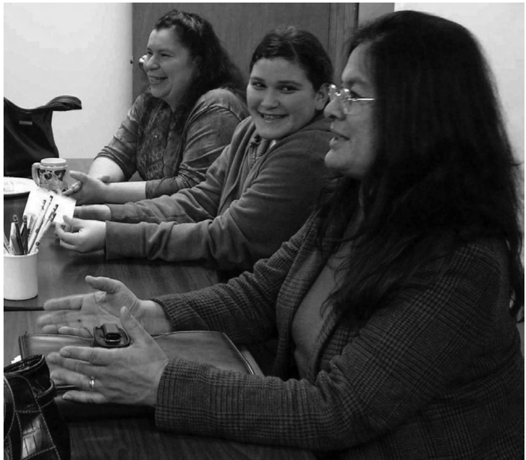
University of Missouri Extension and Lincoln University conduct seminars, such as this one in Marshall, Missouri, to discuss services and opportunities available to minority farmers.

Web sites: grants - www.sare.org/ncrsare/prod.htm publications - sare.org/publications/index.htm