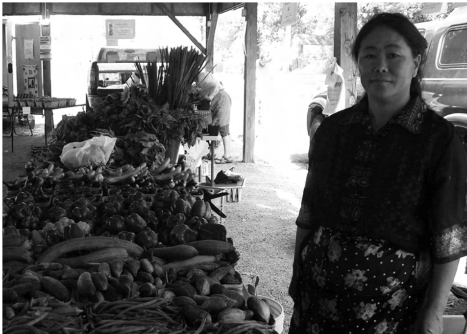
At a farmers' market, this woman sells produce that she and her family grow in southwestern Missouri. They could benefit from programs that the Missouri Agricultural and Small Business Development Authority (MASBDA) and other agencies offer for small farmers.

Web sites: offices.usda.gov www.fsa.usda.gov/mo