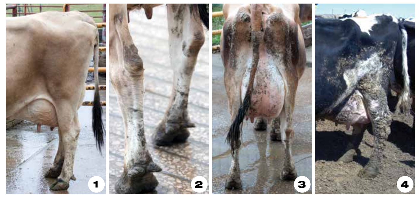
Figure 3. The National Dairy FARM Program's hygiene scorecard ranges from 1 for clean to 4 for dirty. The udder score is the hygiene score most related to milk somatic cell count (SCC).

procedures.) Minimize the time the unit is on the cow when milk flow is low so as to minimize teat end damage. You can get a good indication of the health of the cows' teat ends just by looking at them. Also, aim for leaving about 1 cup, or 250 milliliters, of milk in the udder at the end of milking. Although undermilking costs producers some saleable milk, overmilking costs producers more through an increased incidence of mastitis.