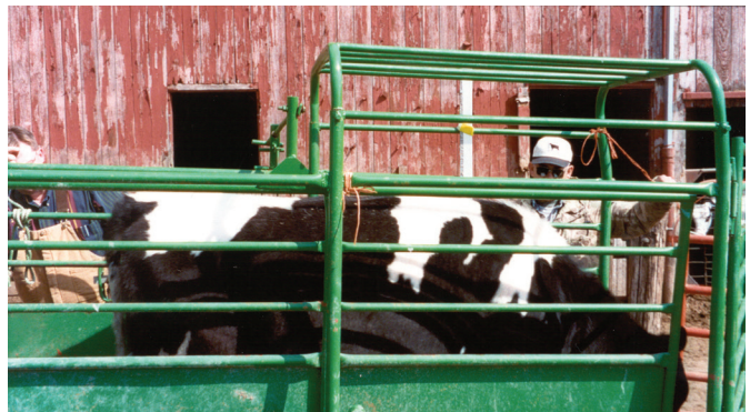
Figure 5. Weighing heifers at critical stages of development enables producers to gauge the effectiveness of their management program.

Some producers elect to weigh heifers at critical stages of development (weaning, 6 months, 12 months, breeding and springer) to determine the effectiveness of their heifer-rearing program. This allows the producer to adjust nutritional planes to ensure proper gain (Figure 5). Others have incorporated a less strenuous routine by measuring wither height and estimating body condition to aid them in monitoring the heifer's progress. Regardless of the method, a management program will help producers reduce age at first freshening and attain optimum body size.