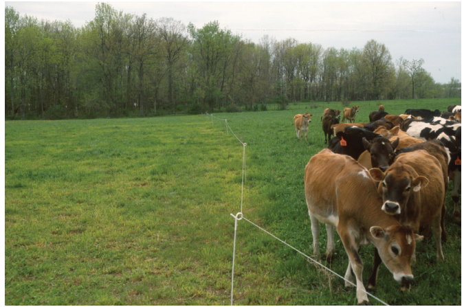
Figure 4. Strip grazing is one of the best ways to provide high-quality pasture for replacement heifers.

At weaning (about 60 days) the calves were separated by weight and breed into two groups, one of which received 2 pounds per day of 19 percent crude protein calf starter and the other 4 pounds. Both groups of heifers showed an average daily gain (ADG) of 1.5 pounds per day after weaning until the end of the grazing season. This trial would indicate that weaned heifers can show an adequate rate of gain, if 1.5 pounds ADG is acceptable, on high-quality pasture after weaning. However, to achieve this level of performance, the heifers must be fed extremely