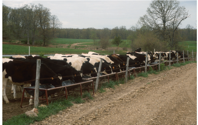
Figure 6. Heifers are capable of gaining 1.75 pounds a day with a well-managed MIG system that included supplementation.

managed in a grazing system. Heifers began the trial with initial weights of 400 pounds and ended with final weights of 1,300 pounds at freshening. Supplementation included a grain mix (75 percent soyhulls, 25 percent wheat midds plus a vitamin-mineral mix) at 0.5 percent of body weight in the spring and 0.75 percent during the winter months (Figure 6). Harvested forages were fed ad libitum during winter months. This suggests that heifers can be raised to reach optimum sizes and freshen near 24 months of age when managed properly.