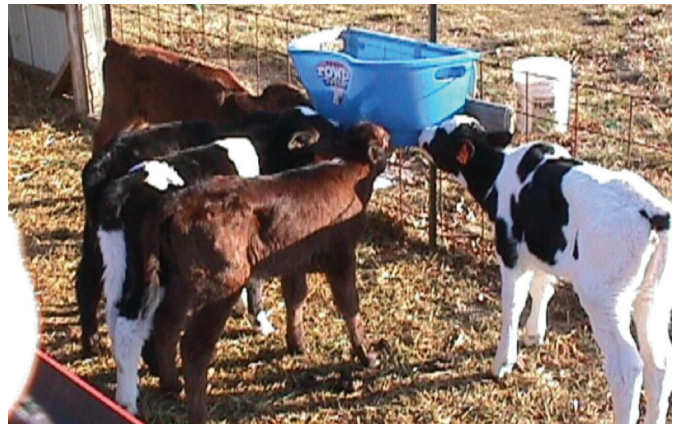
Figure 3. Mob or group feeding of calves allows producers to manage large groups of similar age and sized heifers.

Some producers have tried to eliminate this problem by electing to “mob feed” several calves at the same time. Equipment for mob feeding consists of a tank with several specialized nipples either connected directly to a small reservoir or attached by tubes extending to the bottom of the tank (Figure 3). Nipples are designed with check valves to keep milk in the tubes or nipples if the vacuum is broken by the calf releasing the nipple. Milk is generally fed twice daily to reduce incidence of calves scouring and spoilage of the milk. Manufacturers recommend cleaning and sanitizing the equipment only after a group of calves has been weaned. Reports from New Zealand as well as Missouri indicate that scours and other illnesses are less of a problem than that of feeding individual calves.