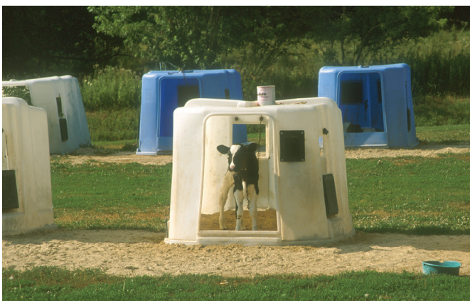
Figure 2. Individual calf hutches enable producers to concentrate calving of large groups of heifers.

Many dairy grazing operations attempt to calve in clusters rather than freshen year-round. Producers may calve in windows of 45 to 60 days followed by a noncalving period. This enables producers to concentrate and manage larger groups of heifers of similar age and size. However, this mass calving will require more available labor at calving and the need for more calf housing and rearing equipment (Figure 2).