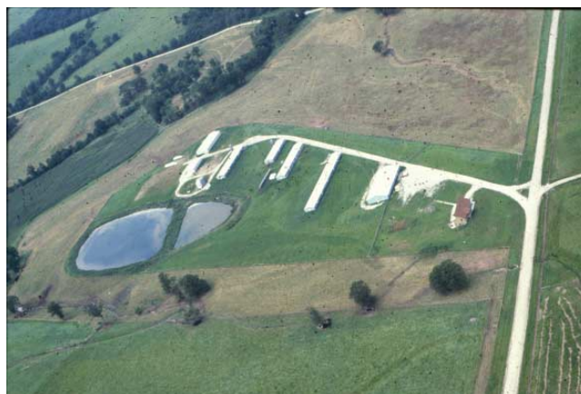
Figure 1. A livestock feeding operation site should be selected to minimize visual contact with neighbors and traffic and to separate odor-producing facilities from neighbors.

Odors are inherent in livestock operations, especially when manure is being applied to the land. The larger the livestock operation, the more important it is to plan, design, construct and operate the facility in a manner that will minimize off-site (and on-site) odors. It is important to control sufficient land to provide an adequate buffer between neighbors and the more odor-