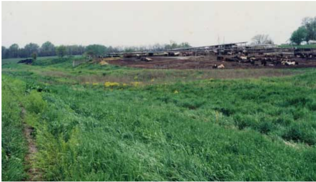
Figure 3. Open-lot systems should be located on well-drained sites and runoff should be controlled.

Avoid building in a poorly drained site, on a flood plain or on sites with seeps, springs or a high water table.