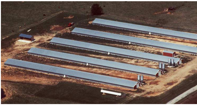
Figure 2. The naturally ventilated livestock buildings at this facility are spaced to allow for summertime air flow.

ing of diseases that may be brought in from the outside. The minimum radius for driveways used by semitrailers is approximately 55 feet.