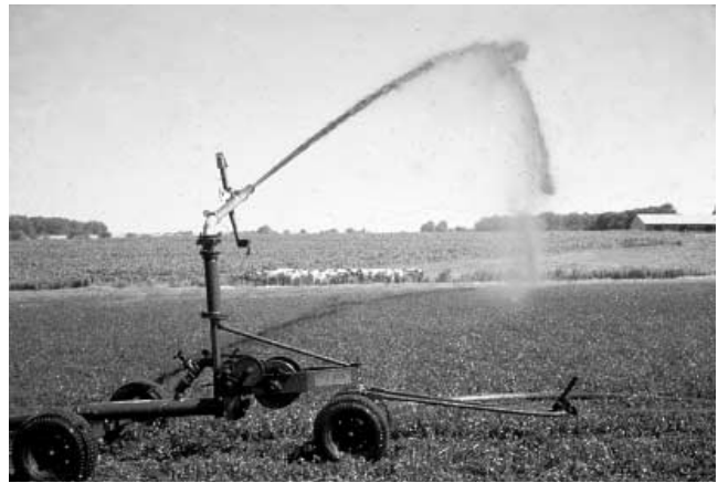
Figure 5. Traveling guns are a common means of irrigating lagoon effluent onto fields.

The larger livestock operations use conventional center-pivot irrigators to apply lagoon effluent with