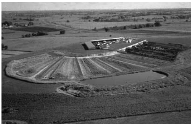
Figure 4. Lot runoff from this beef feeding facility is routed to a lagoon for later land application by irrigation.

Lagoon systems are applicable where flushing is desired or where significant amounts of lot runoff must be contained (Figure 4). Large holding ponds are also used to store lot runoff until the effluent can be applied to the land. Flushing is one method of manure collection and transportation for livestock confinement systems. Flushing eliminates the labor required for scraping and moving manure to storage. Lagoons complement flushing systems because they provide storage at relatively low cost and usually do not cause unacceptable odor problems if judiciously located. Lagoons can also provide a source of flush water. Fresh water flushing should be used only if the system is designed for fresh water flushing.