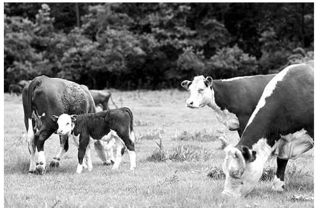
Figure 1. The majority of beef cattle in Missouri are managed in pasture systems that do not require a permit under the state's Clean Water Law.

For more details, see Guide to Animal Feeding Operations , May 1999, Missouri Department of Natural Resources — Water Pollution Control Program, P.O. Box 176, Jefferson City, MO 65102.